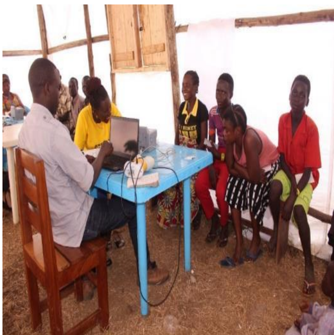
UNHCR staff in Kagoma Reception Center in Kyangwali undertake biometric verification for refugees

In October 2018 as a preliminary step to its pilot project in Uganda's Kyangwali refugee settlement, Internews rolled out a rapid assessment. The assessment sought to examine the information and communication methods accessed and preferred by the different refugee communities in the settlement, and to identify information gaps among the refugee and host populations. Given the project's focus on improving information as part of the SGBV response among Congolese refugees, the assessment also sought to better understand the community engagement structures, legal-judicial and other services available to refugee survivors of SGBV.