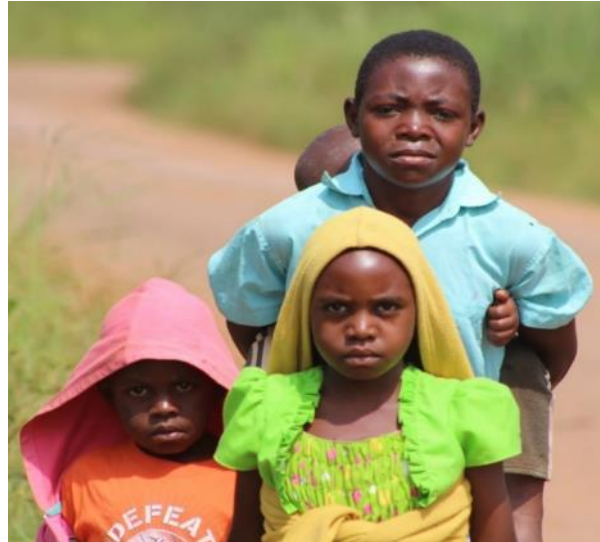
A group of refugee children in Kyangwali