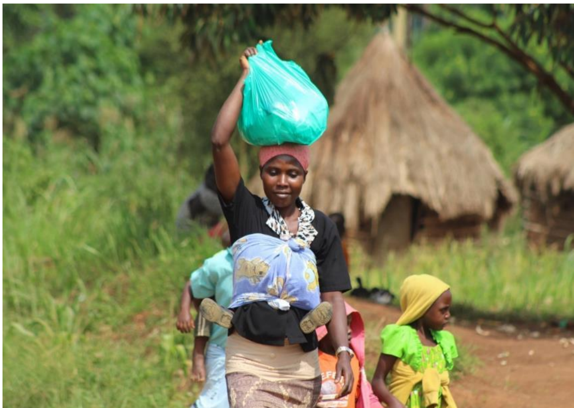
A family in Kyangwali refugee settlement

incidents of sexual violence (Rape and sexual assault). In settlements, physical assault was the most reported incident. Among males, denial of resources and emotional abuse at household level were the key incidents reported. Key drivers of SGBV were gender inequalities, conflict, power-imbances, insufficient food at home and alcoholism. In Kyangwali, the community was mobilized and participated in community policing and community meetings in Maratatu B and Maratatu D where 295(61M; 234F) POCs participated in promoting peaceful co-existence to address SGBV issues. 43