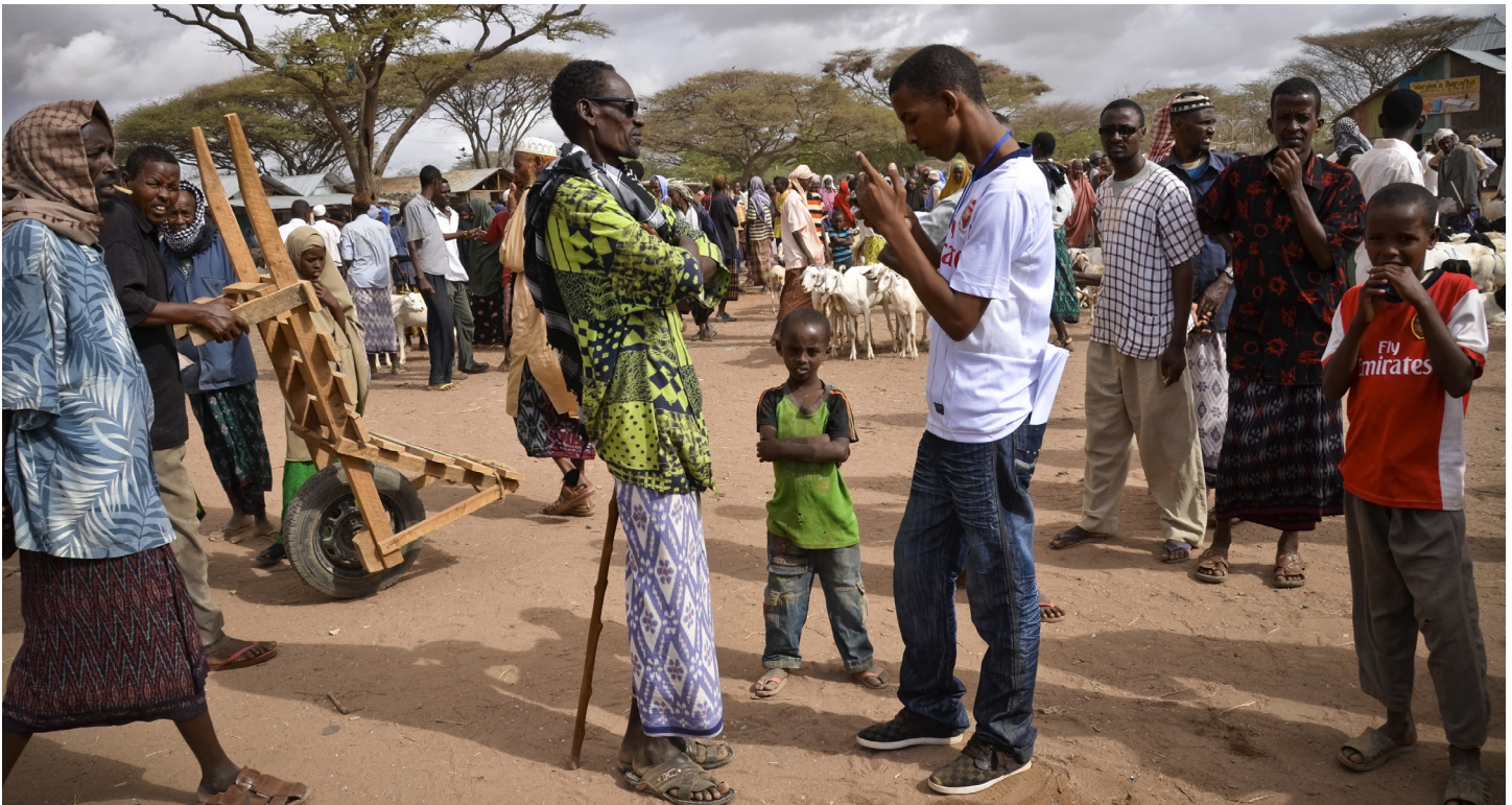
Dadaab refugee camp in Kenya.