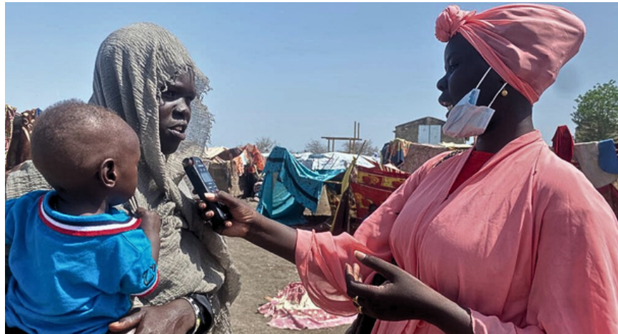
PHOTO: A CEN Community Correspondent talking to a returnee at the Renk Transit Center on the importance of immunization.

We provide a two-way information platform that connects community members with verified and actionable information from humanitarian responders to connect the community with services, elevate community voices and inform decision making. This project serves thousands of people displaced by the conflict in Sudan and the local host community in Renk County, Upper Nile State in South Sudan.