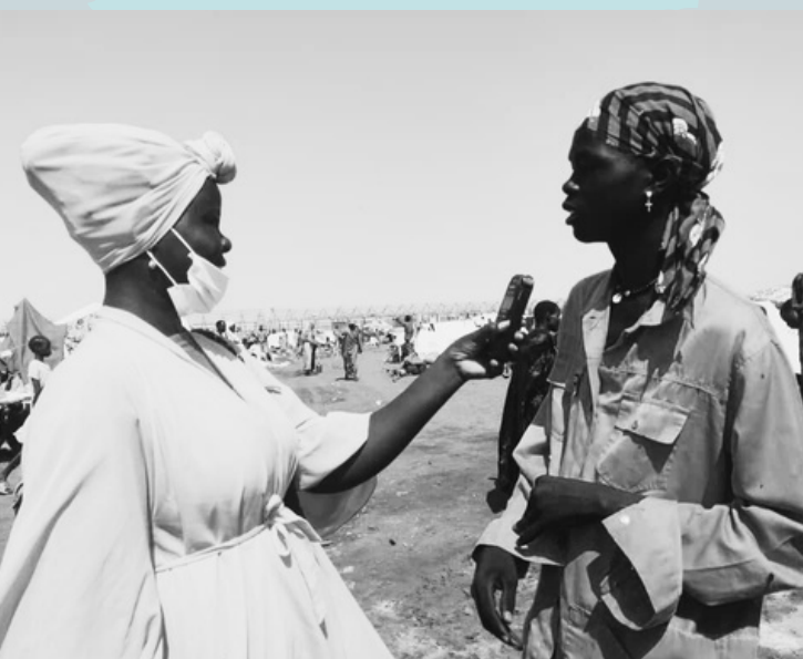
PHOTO: A CEN Community Correspondent talking to a returnee at the Renk Transit Center