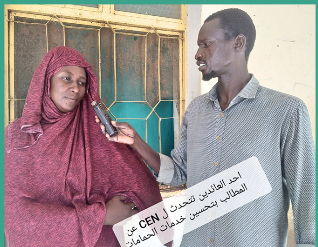
PHOTO: CEN Correspondent interview a refugee in Renk, Upper Nile. © CEN

If you want to contribute to this bulletin or discuss our data please contact: