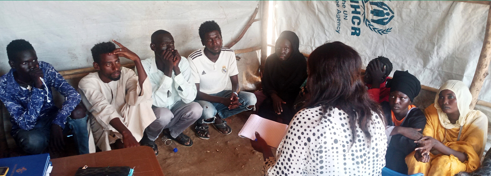
PHOTO: Renk Community Correspondent interviewing returnees and refugees about their needs at the Transit Center in Renk, Upper Nile.

Supported by the World Food Program (WFP), Internews is working with the Community Engagement Network (CEN) to respond to community information gaps, concerns and needs at the Renk Transit centre. We provide a two-way information platform that connects community members with verified and actionable information from humanitarian responders to connect the community with services, elevate community voices, and inform decision-making. This project serves thousands of people displaced by the conflict in Sudan in Renk County, Upper Nile State in South Sudan.