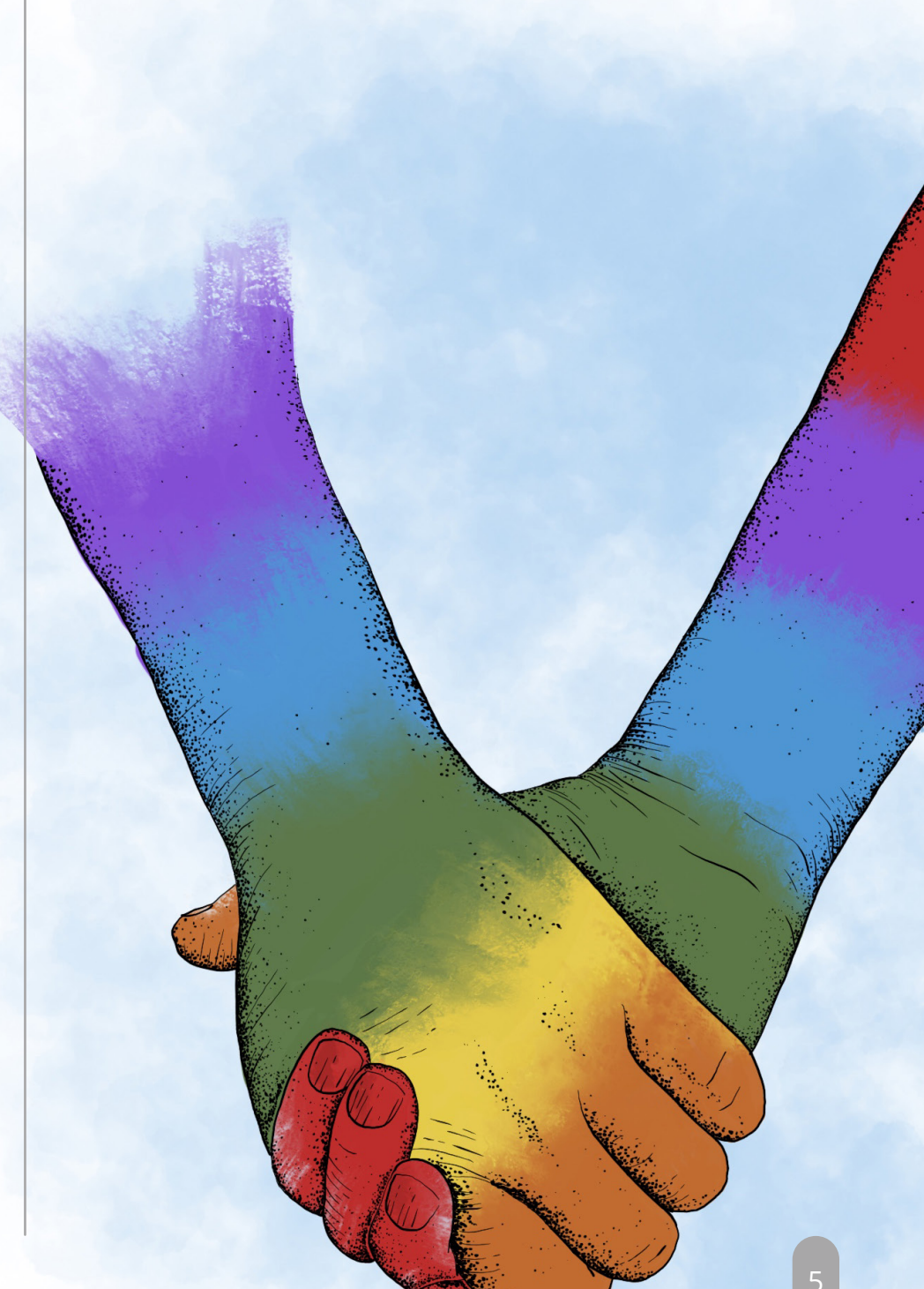
"FACE TO FACE": SOME EXPERIENCES OF STRUGGLE AND INFORMATION WITH THE LGBTQIAP+ INDIGENOUS AND QUILOMBOLA POPULATION IN BRAZIL

encountered, the key lessons learned, recommendations for engagement actions aimed at the humanitarian sector, journalists and communicators, and a list of references and indications for reading, as well as contacts with the main interlocutors of this work and other associations working on this important theme. Enjoy your reading!