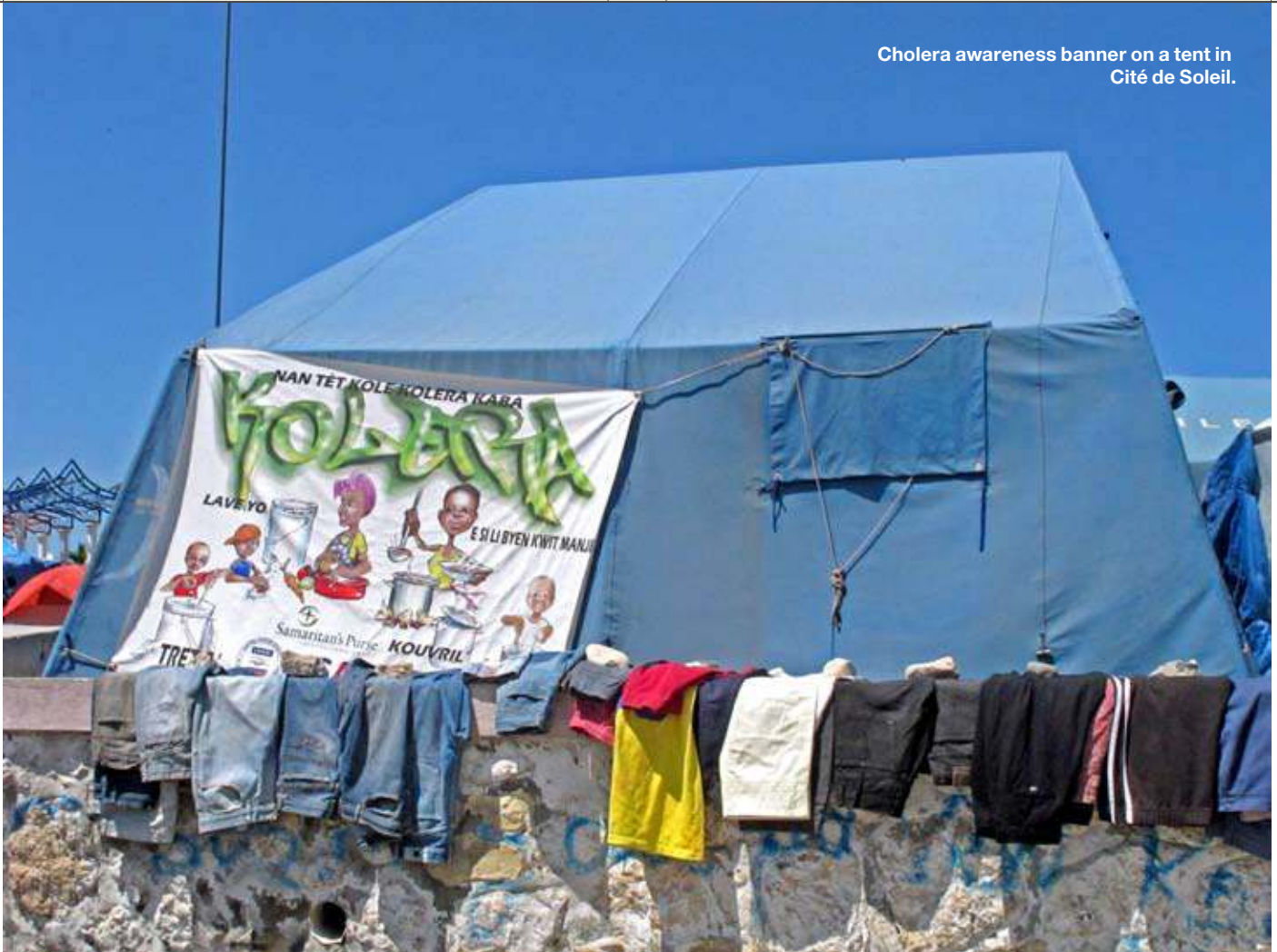
Cholera awareness banner on a tent in Cité de Soleil.