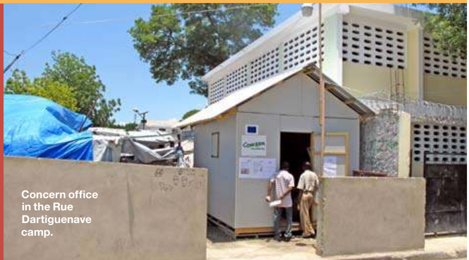
Concern office in the Rue Dartiguenave camp.

Concern was careful to put all distributed documents on public display and provided an ongoing source of information and discussion at the camp office, where local staff could meet with