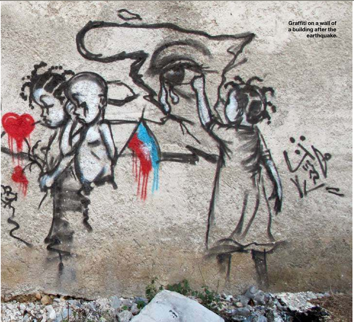
Graffiti on a wall of a building after the earthquake.

“I would say that registration [of those in camps] would have been almost impossible without the support of the communications teams.”