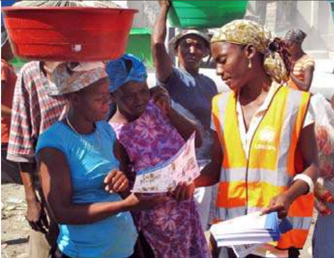
UNOPS community mobilisers hand out government fliers and explain cholera.

communication staff able to reach out to survivors, not simply meetings with project staff. In Haiti, this was most obviously implemented through the work of community mobilisers (also called 'liaison' or 'animation teams' by some organisations). This kind of work was key for three main reasons. Firstly it was often the best way to share information, especially on complex issues, as it allowed for dialogue and for recipients to ask questions. Secondly, person-to-person communication was by far the best means of sharing practical information that required demonstrations such as securing tents. Thirdly, the feedback from Haitians strongly suggests that they liked face-to-face communication because of its psychosocial value: the feeling that someone cared and was willing to talk to them.