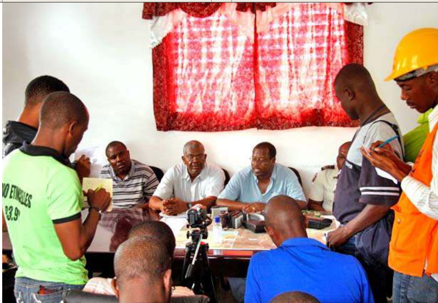
A local press conference at the Gonaives City Council, November 6 th 2010. GUILLAUME MICHEL