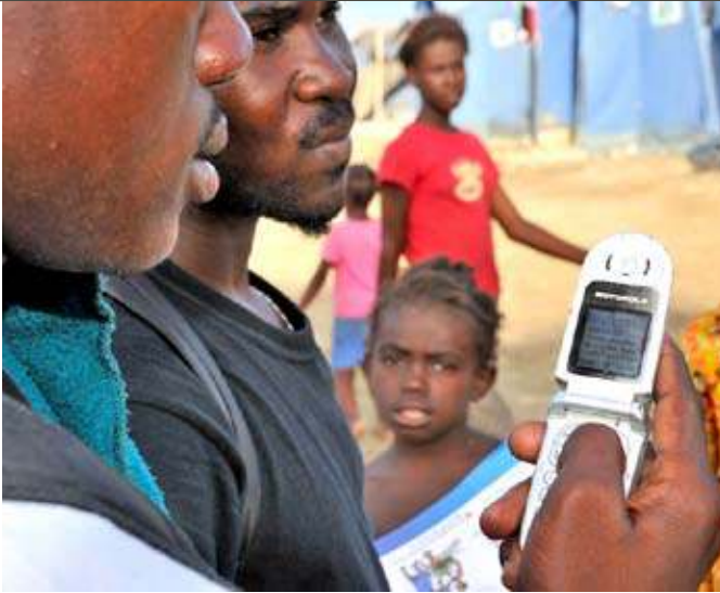
Man receiving a text about cholera on mobile phone.