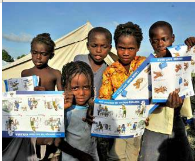
Cholera campaign and kids.

The strength and commitment of the Ministry of Public Health was also a factor, particularly in ensuring