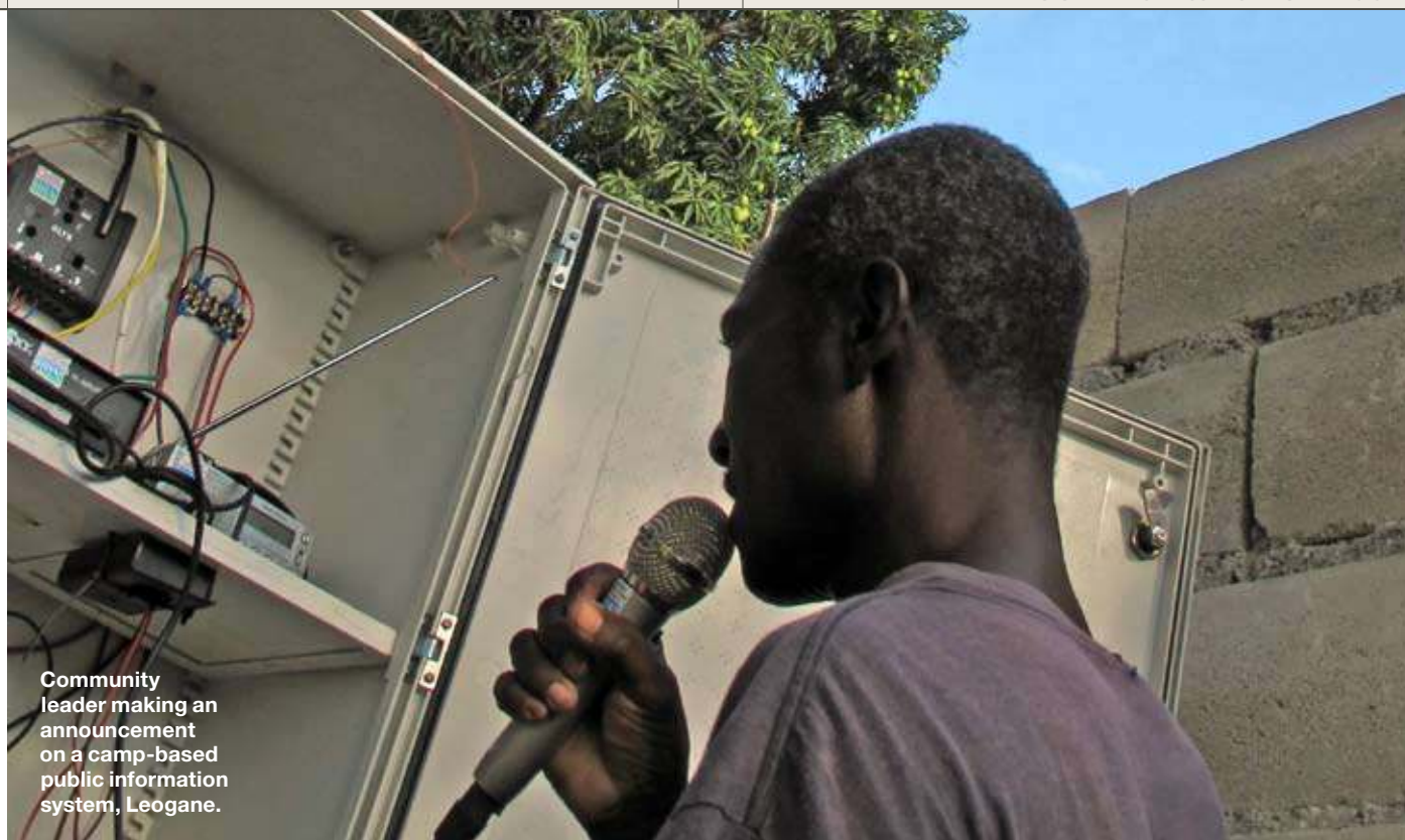
Community leader making an announcement on a camp-based public information system, Leogane.