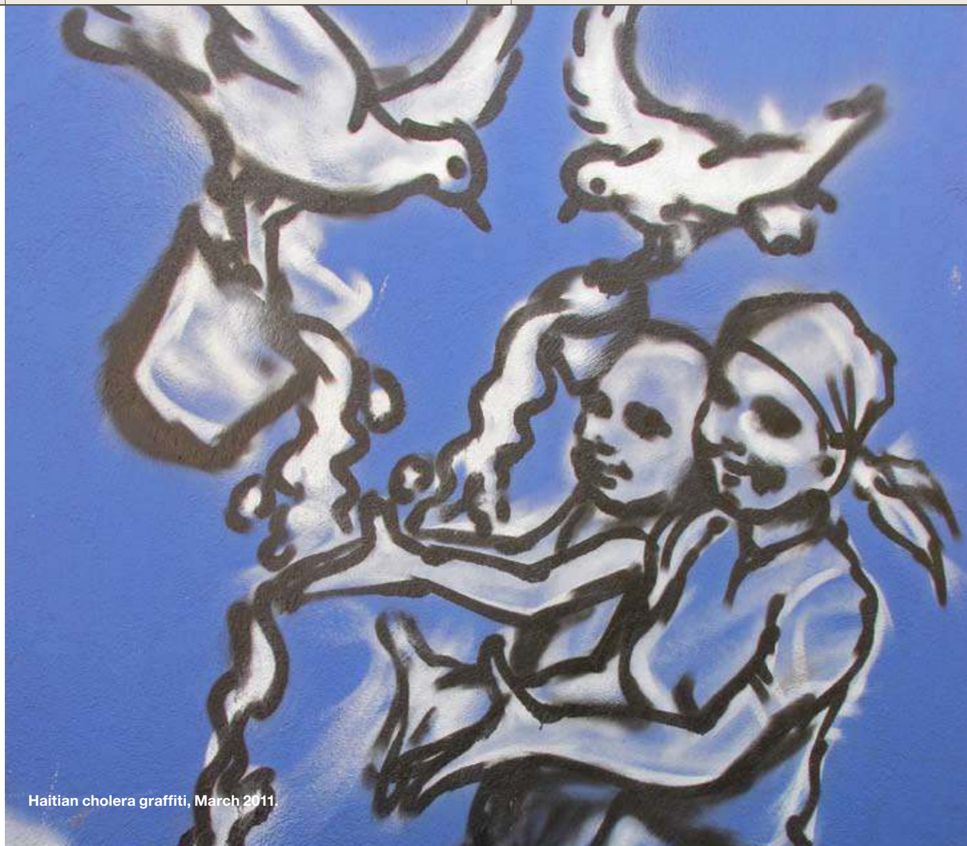
Haitian cholera graffiti, March 2011.

Almost uniformly, the approach taken to determining impact was a classic baseline/endline methodology, which looked for retention and action on the key messages promoted by the cholera information campaign. The evidence provided by the HRC paper and discussions with medical staff and community mobilisers suggest that this was not adequate as an approach, with little scope for identifying key barriers to behaviour change from the Haitian perspective.