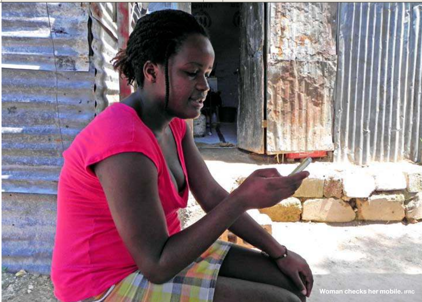
Woman checks her mobile.