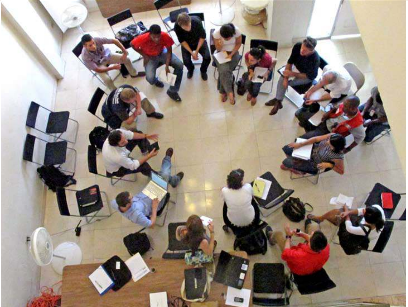
CDAC Haiti meeting, November 2011.

mobilisation team, for example, frequently went to camps to facilitate discussion and explain upcoming initiatives before they were launched as a way of keeping situations calm and community relationships smooth.