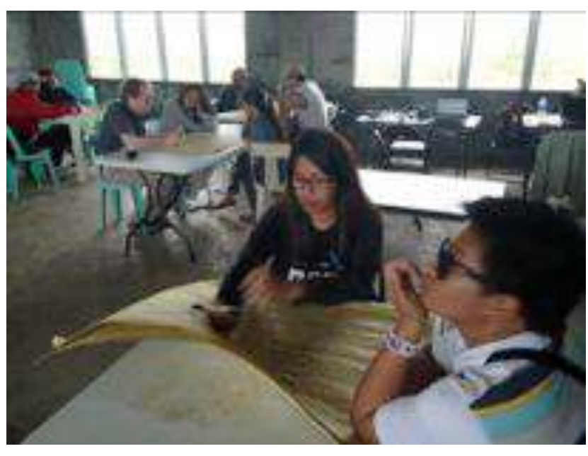
Figure 14: Training session with Bakdaw staff

In Guiuan, after going off air, Internews also gave a training session on humanitarian reporting and journalism ethics to the staff or Radyo Natin, some staff of the municipality and a group of students.