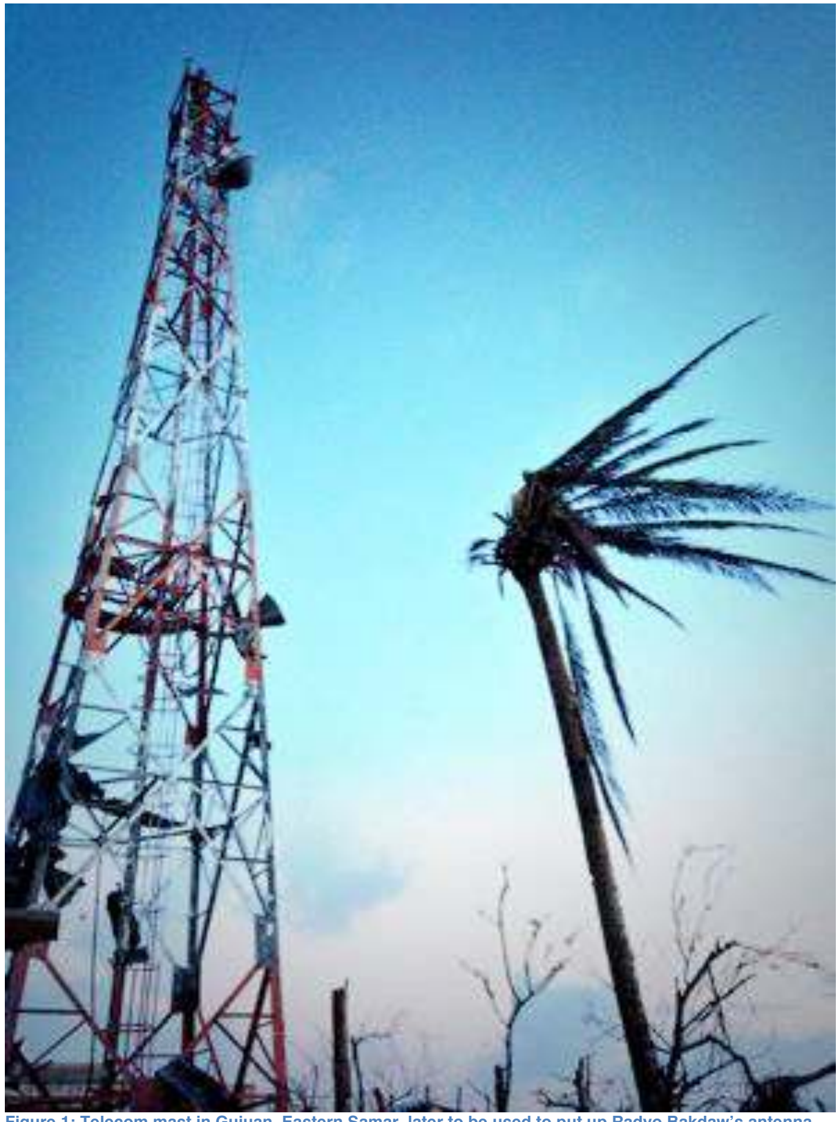
Figure 1: Telecom mast in Guiuan, Eastern Samar, later to be used to put up Radyo Bakdaw's antenna.