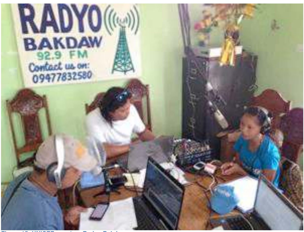
Figure 15: UNICEF guest on Radyo Bakdaw

The development of these shows has been driven and supervised by the Humanitarian Reporting Trainer who used the production-phase of two weeks to give a lot of extra trainings for our staff on a variety of topics (interviewing, drama-production, recording skills...).