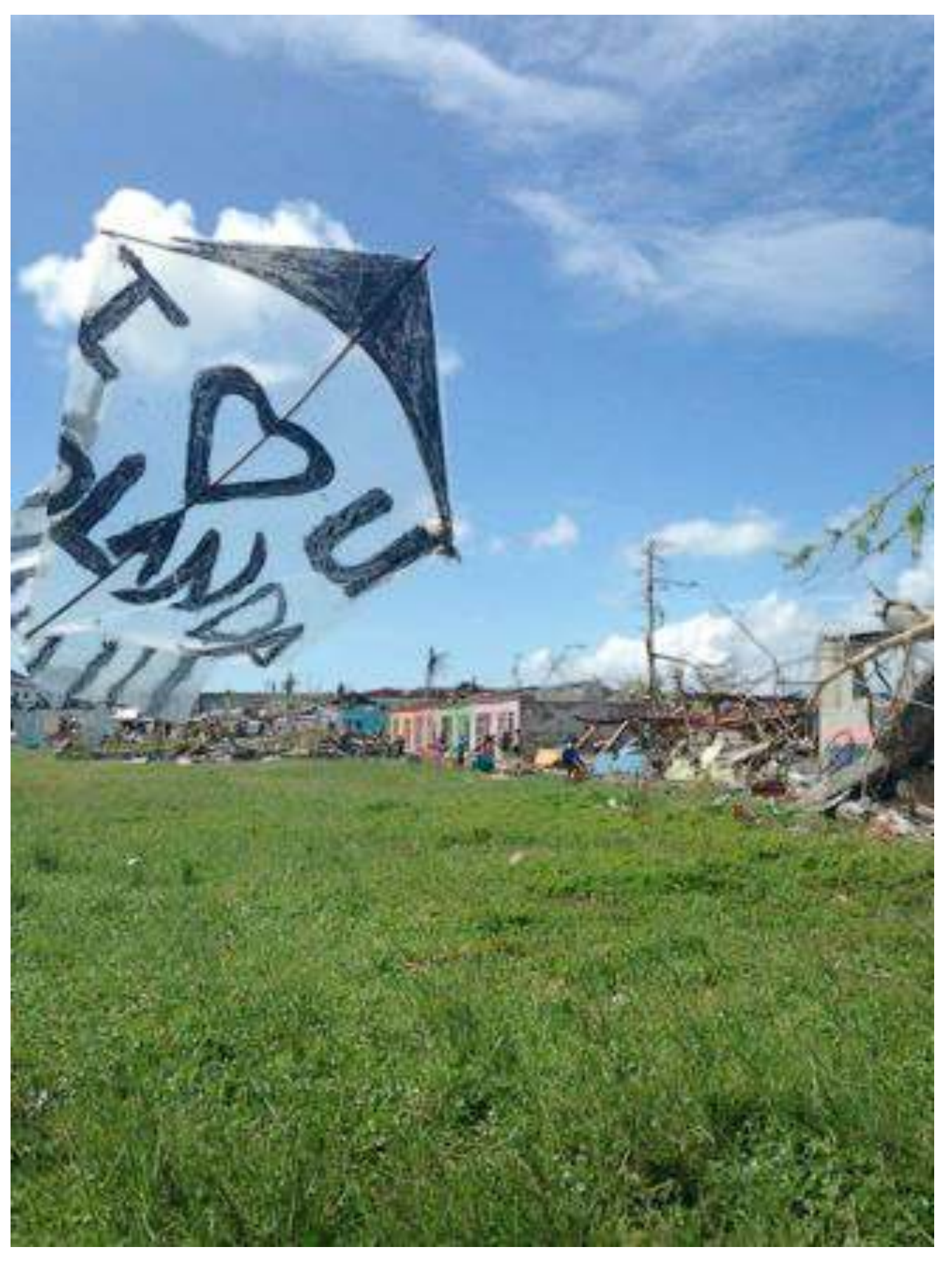
Figure 2 "I love Yolanda" kite, made by local youngsters in Guiuan, Eastern Samar