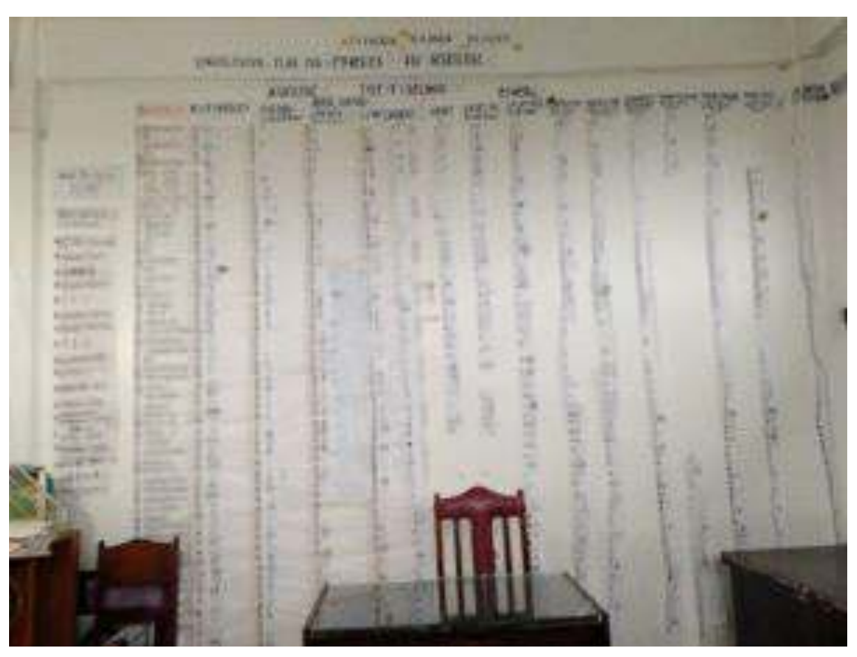
Figure 16: wall with the latest statistics in the town hall of Guiuan