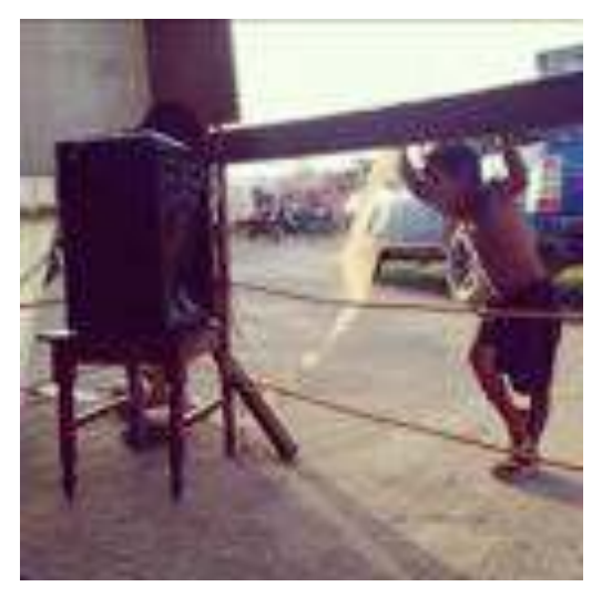
Figure 9: One very attentive listener

According to accounts from Telecom Sans Frontieres, FM signal is still available in Marabut, 86 kilometres down the road from Guiuan to Tacloban. Obviously the distance is shorter "as the crow flies", but either way this is the longest distance which has been reported to us.