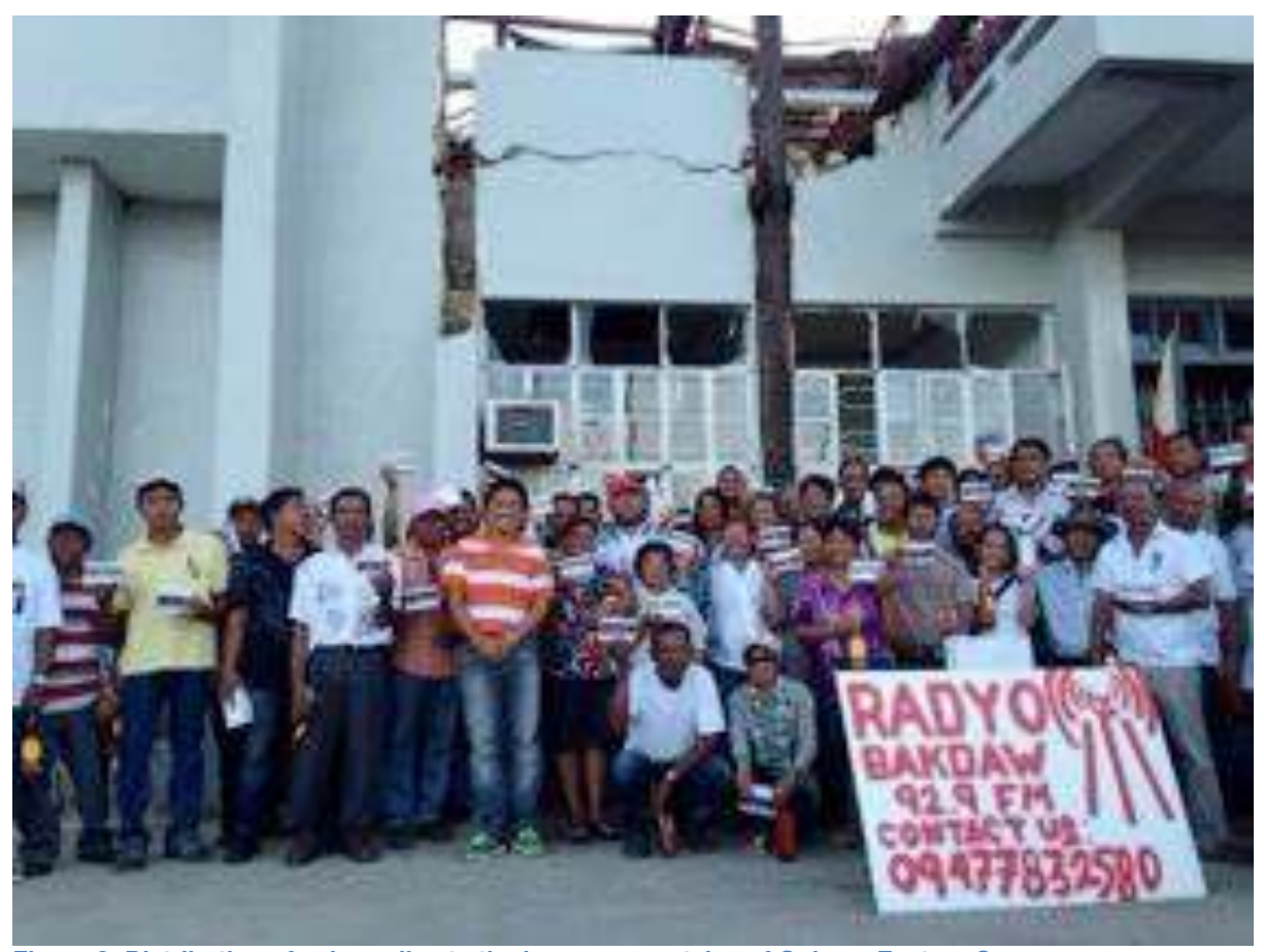
Figure 8: Distribution of solar radios to the barangay captains of Guiuan, Eastern Samar

For Guiuan, Internews was invited to the swearing in ceremony of the 60 Barangay captains of Guiuan. A formal handover was written into the programme and Internews was given the opportunity to speak to all barangay captains and other representatives of local government on the importance of communication in the humanitarian response.