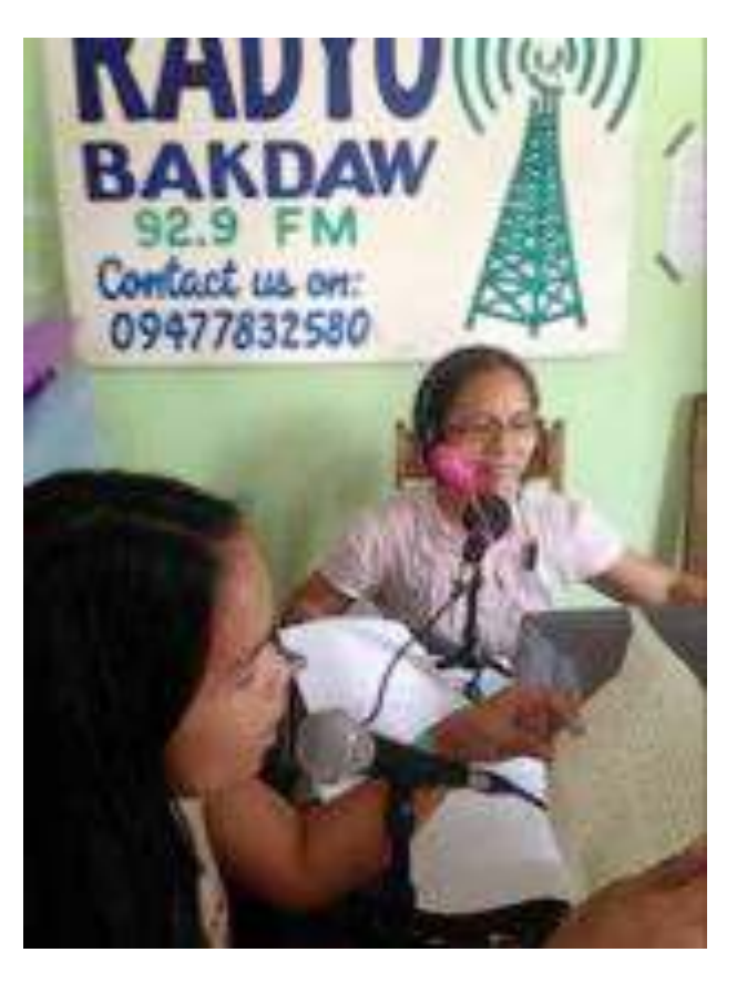
Figure 6: a letter from a listener on Valentine's Day

Reporters are assigned on a daily basis to go into the community to record the questions people are struggling with. These questions are being dealt with on air, initially looking for answers from the audience, but simultaneously reporters will ensure every question gets an answer by approaching local government and the humanitarian partners.