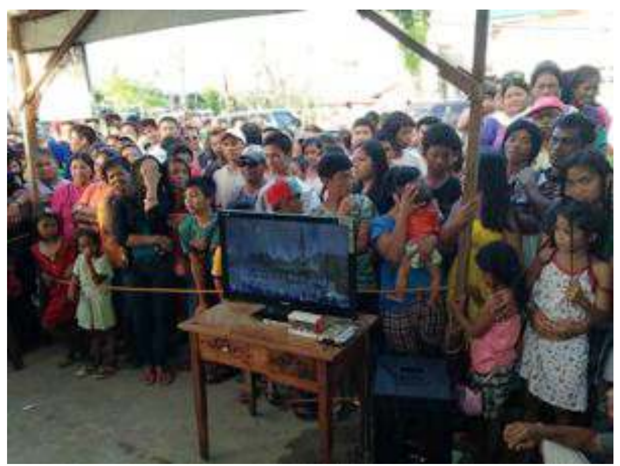
Figure 10: Live Karaoke Contest on Radyo Bakdaw

The karaoke-contest draws a large audience, who, when being interviewed, all indicate how the show makes them feel more "human", by just being able to sing and have fun together.