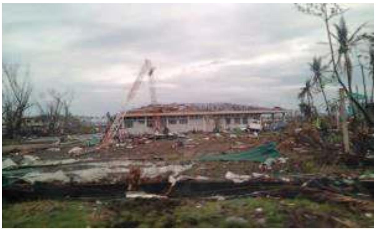
Figure 3: former radio station outside of Tacloban