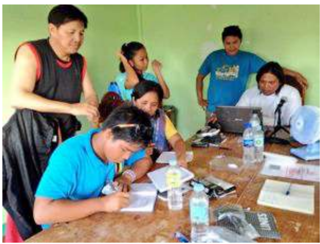
Figure 4: part of the start up team of Radyo Bakdaw

After consulting the humanitarian partners, including ILO, and a meeting with the owner of the previous radio station, staff will receive a salary of 600 PhP/pesos a day (about 8 GBP).