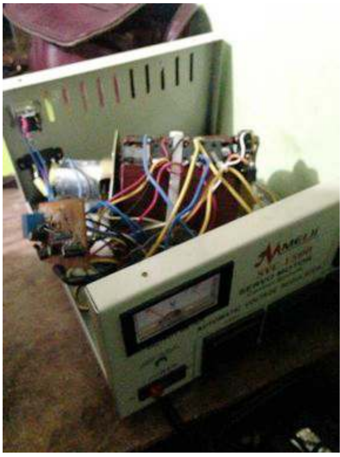
Figure 12: a broken Automatic Volume Regulator at the Radyo Bakdaw studio