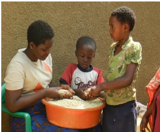
A Congolese family threshes maize cobs at their home in Kentomi Village, Kyangwali Refugee Settlement

Uganda's judicial system lacks the mechanisms in place to keep track of and legislate cases of SGBV that occur while asylum-seekers are in transit.