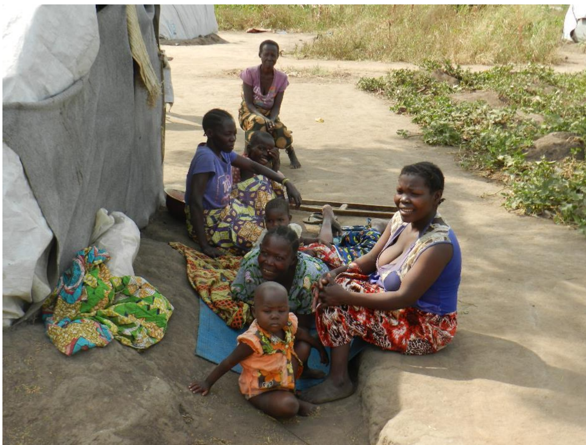
A Congolese refugee family shares a light moment in Kavule Village, Kyangwali Refugee Settlement

Women are specially singled out in General Recommendation (GR) No. 33 of the Committee on the Elimination of Discrimination Against Women (CEDAW Committee) which elaborates the obligations of States parties in ensuring that women have access to justice.