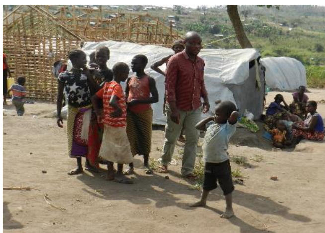
Internews staff with a group of Congolese refugees in Kavule Village, Kyangwali Refugee Settlement.

Women are specially singled out in General Recommendation (GR) No. 33 of the Committee on the Elimination of Discrimination Against Women (CEDAW Committee) which elaborates the obligations of States parties in ensuring that women have access to justice.