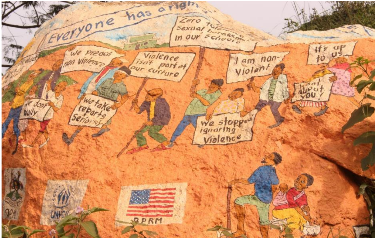
SGBV Prevention messaging in Kyangwali refugee settlement

Across the interview groups and KIIs, there was consensus that while SGBV response services are available in Kyangwali, they are hardly sufficient to cater for the refugee population. Local leadership estimates the levels of awareness for these services at 50% but the reach/access of the same is low due to village locations being remotely located, rendering it difficult for people to attend sensitization meetings.