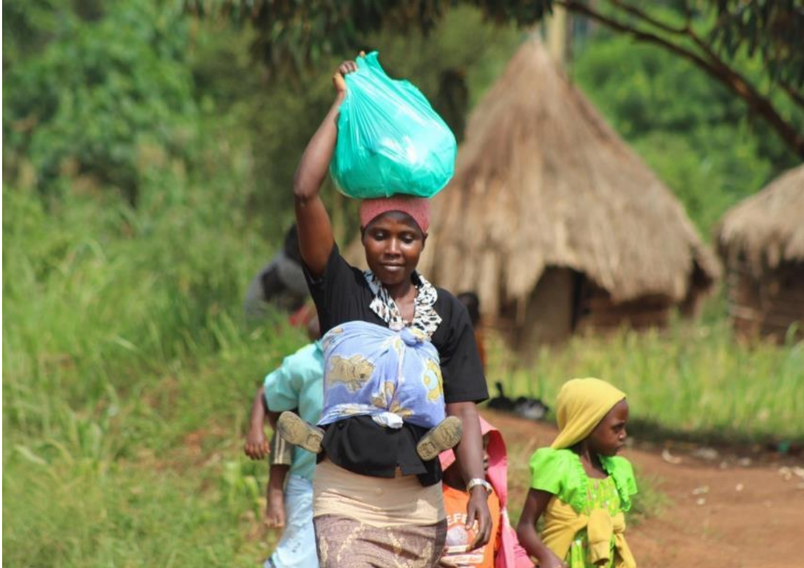
A family in Kyangwali refugee settlement

incidents of sexual violence (Rape and sexual assault). In settlements, physical assault was the most reported incident. Among males, denial of resources and emotional abuse at household level were the key incidents reported. Key drivers of SGBV were gender inequalities, conflict, power-imbalances, insufficient food at home and alcoholism. In Kyangwali, the community was mobilized and participated in community policing and community meetings in Maratatu B and Maratatu D where 295(61M; 234F) POCs participated in promoting peaceful co-existence to address SGBV issues. 43