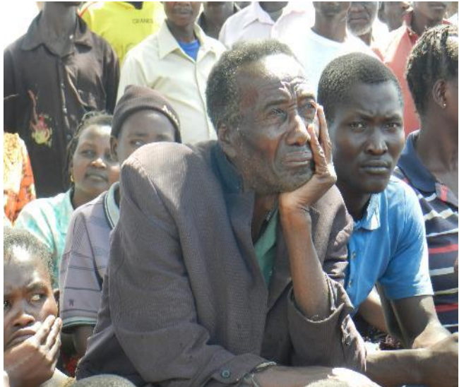
A man listens to the proceedings during a Community Roundtable organized by Internews in Kyangwali under the theme 'Access to Justice for SGBV Survivors' on 28 January 2019