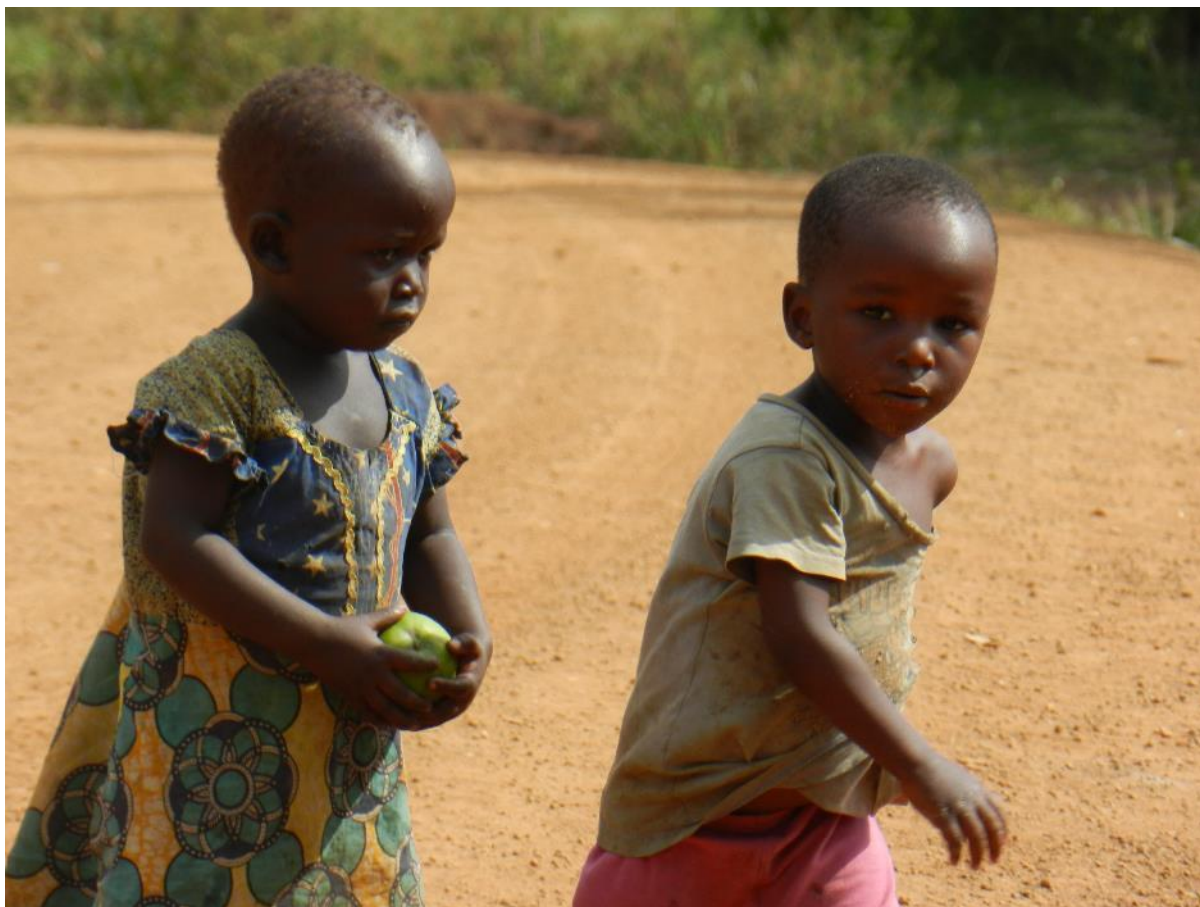
Congolese Refugee children crossing the road in Kentomi Village

In addition to the FGDs with representatives from refugee communities, Internews organized KIs with various stakeholders providing services and support to refugees in Kyangwali. These included local and international humanitarian and legal/human rights organizations, camp leadership, and security officials. Internews also conducted key informant interviews at least half of the 23 humanitarian agencies in Kyangwali, ensuring there was cross-sectoral representation from livelihoods, health, protection, education and camp management.