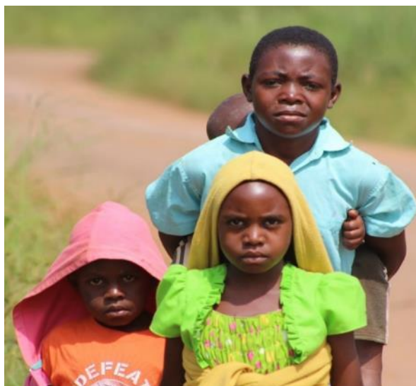
A group of refugee children in Kyangwali