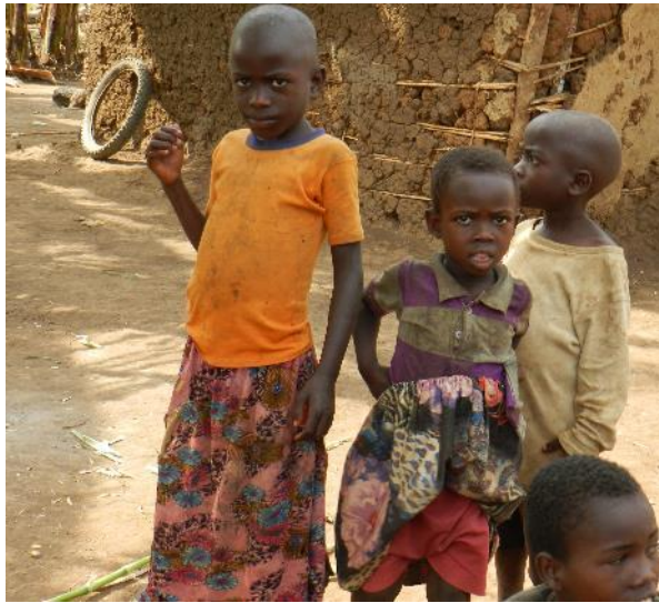
Congolese children at their homestead in Kentomi Village, Kyangwali