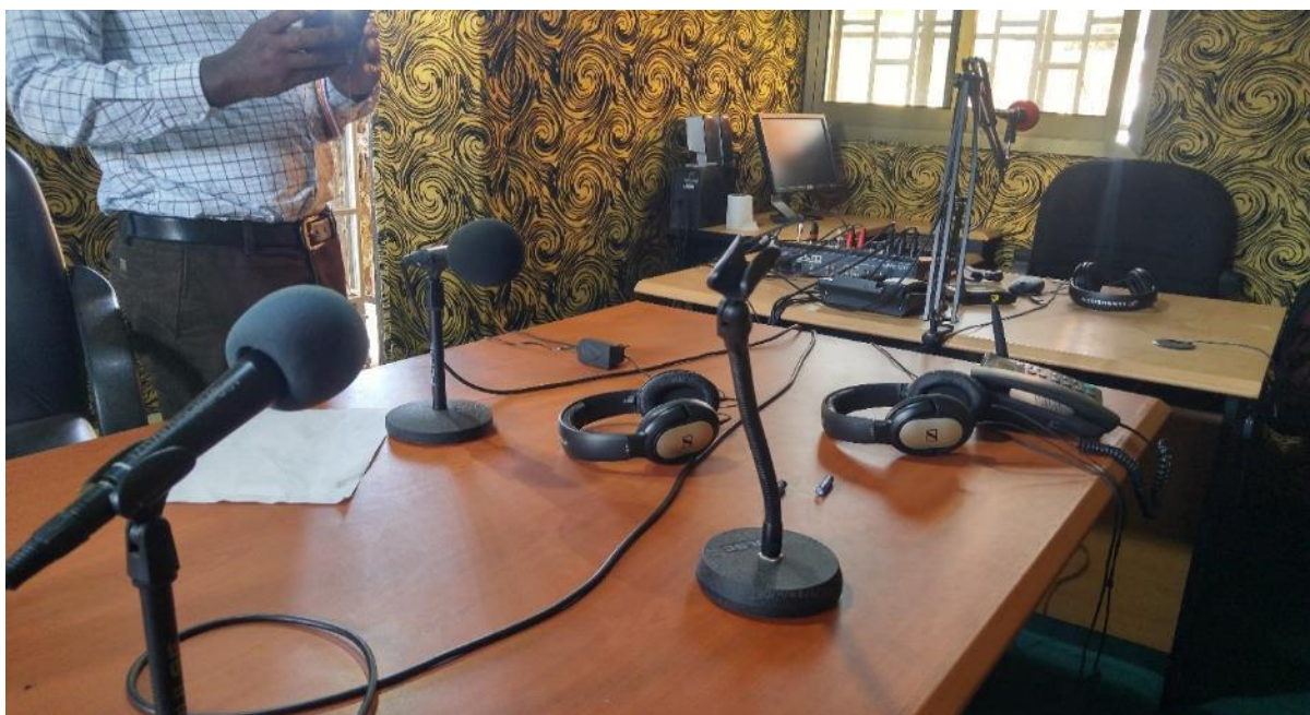
Inside the Radio Station set up by ARC in Kyangwali