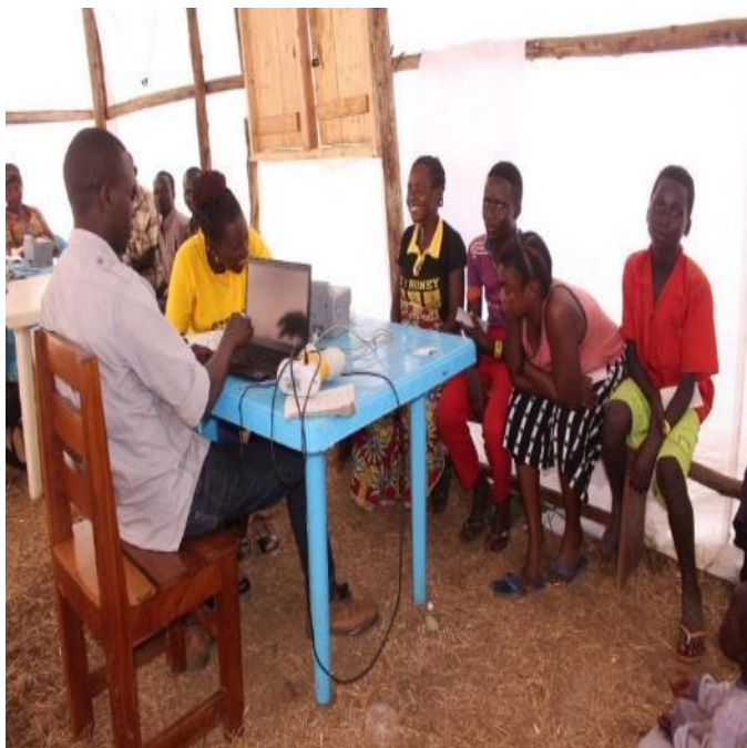
UNHCR staff in Kagoma Reception Center in Kyangwali undertake biometric verification for refugees

In October 2018 as a preliminary step to its pilot project in Uganda's Kyangwali refugee settlement, Internews rolled out a rapid assessment. The assessment sought to examine the information and communication methods accessed and preferred by the different refugee communities in the settlement, and to identify information gaps among the refugee and host populations. Given the project's focus on improving information as part of the SGBV response among Congolese refugees, the assessment also sought to better understand the community engagement structures, legal-judicial and other services available to refugee survivors of SGBV.