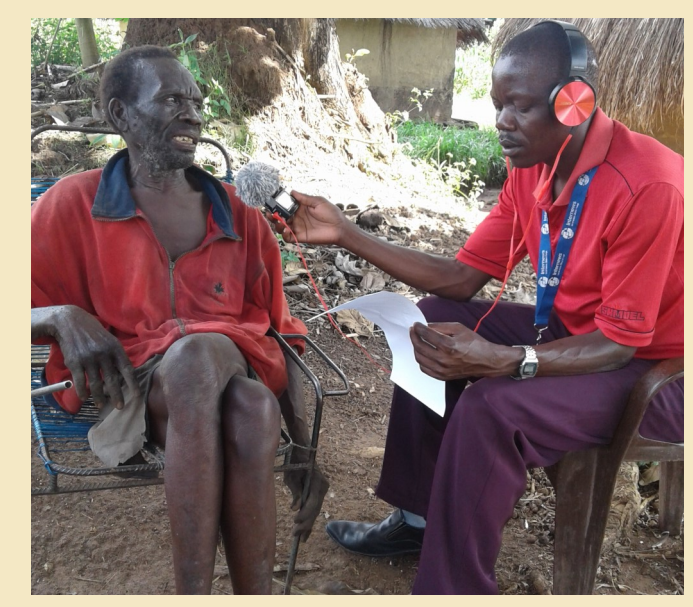
Internews-Yei correspondent Interviewing a man about EVD in Yei Municipality in Yei River State.

Following complaints about numerous cases of stomach ulcers in the community members in Yei, a clinical officer with Martha Health Unit said that the disease is preventable and curable. He urged the people with the disease to adhere to the doctor's prescriptions for the treatment to be effective. Some of the affected community members interviewed by Internews' Community Correspondent complained that the treatment is very expensive. They requested agencies operating in Yei River State to support the State Hospital with medication for ulcers.