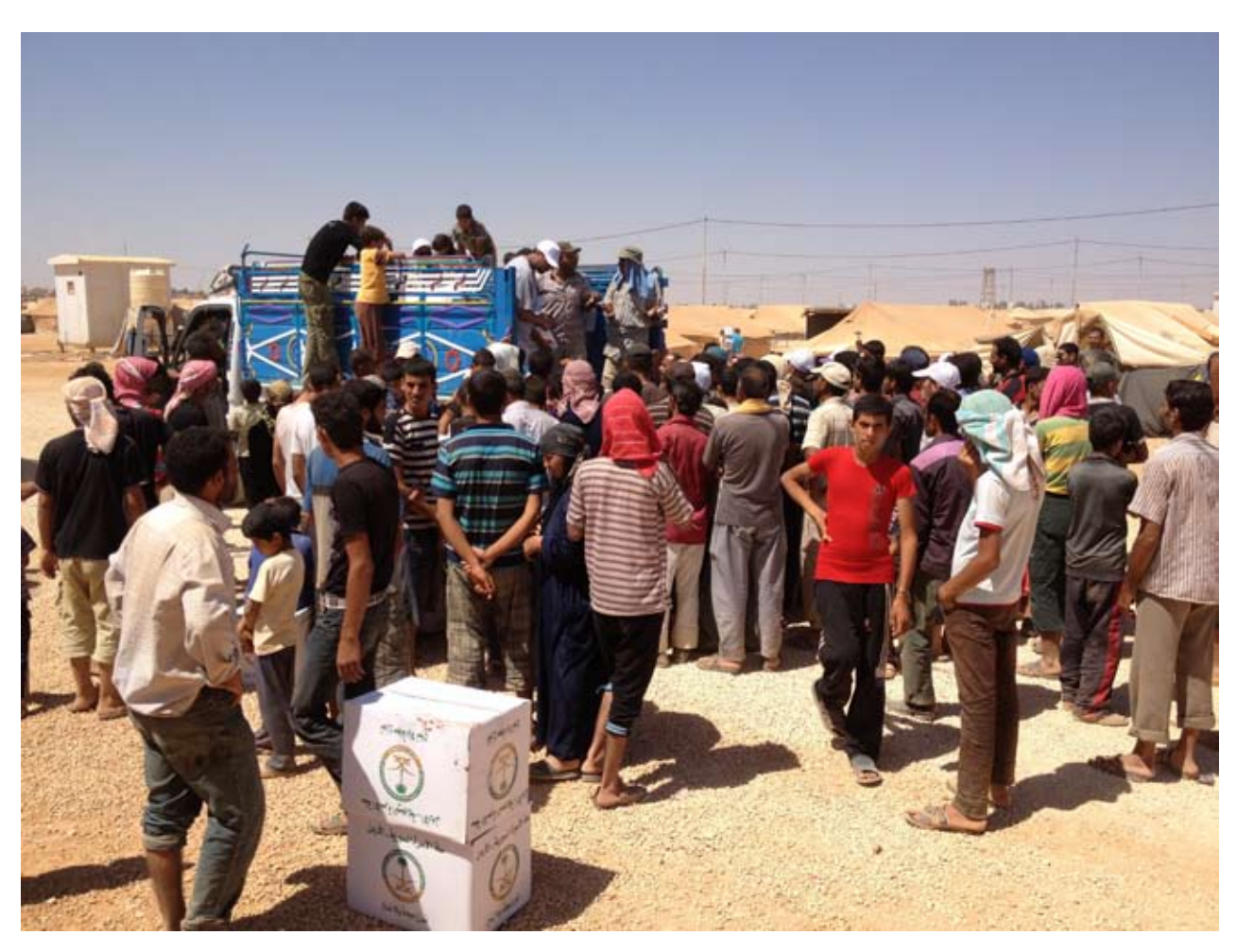
"There is not enough food and water and we are scared to go out in the camp and fetch for ourselves because there are many people looking for them too. Access to services, that's the information we need," affirmed a refugee father of 4 in Zaatari. In the picture, a food distribution takes place. Only men and boys are by the track.

Based on its extensive experience in similar settings, Internews advocates for multi-platform/multichannel approaches using local media, non-mass media communication channels (e.g. community volunteers), traditional/indigenous channels (e.g. religious leaders), or mobile technology and social media, always based on a good understanding of the