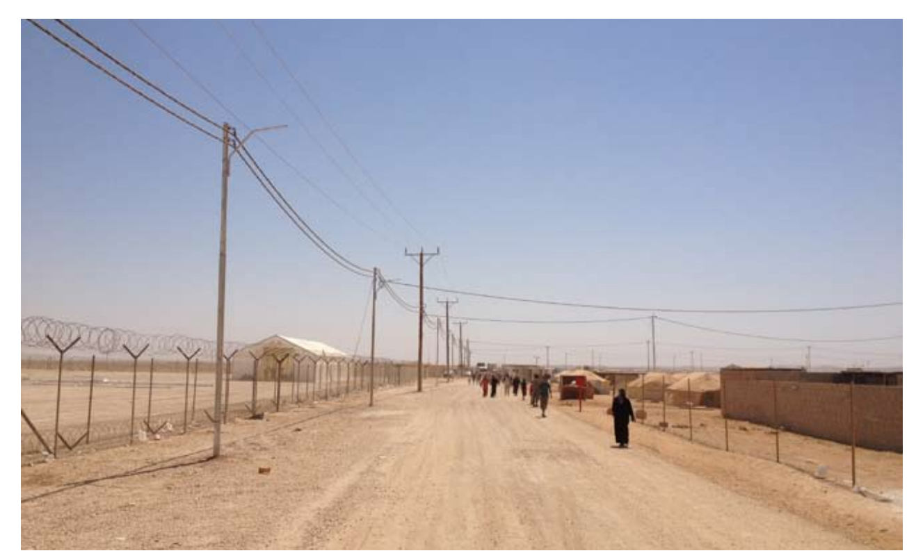
According to the Jordan Times, in response to Amman's "closed camp" policy, Syrian activists and concerned citizens have formed underground "smuggling networks", assisting the flight of Zaatari residents and housing them in a series of so-called safe houses stretching across the northern region.*1 The Interior Ministry policy restricts the movement of refugees within Zaatari, granting only a handful of permits to leave the compounds for "exceptional" cases.

The Jordanian Gendarmerie, the Police, and the Army control the perimeter of this closed-camp;