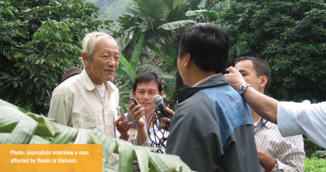
Photo: Journalists interview a man affected by floods in Vietnam.