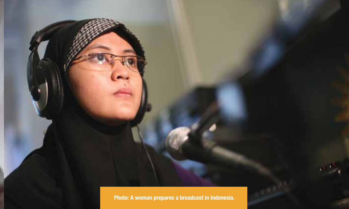
Photo: A woman prepares a broadcast in Indonesia.