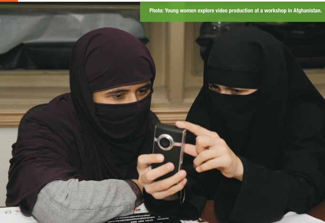
Photo: Young women explore video production at a workshop in Afghanistan.

“By giving voice and visibility to all people—including and especially the poor, the marginalized and members of minorities—the media can help remedy the inequalities, the corruption, the ethnic tensions and the human rights abuses that form the root causes of so many conflicts.”