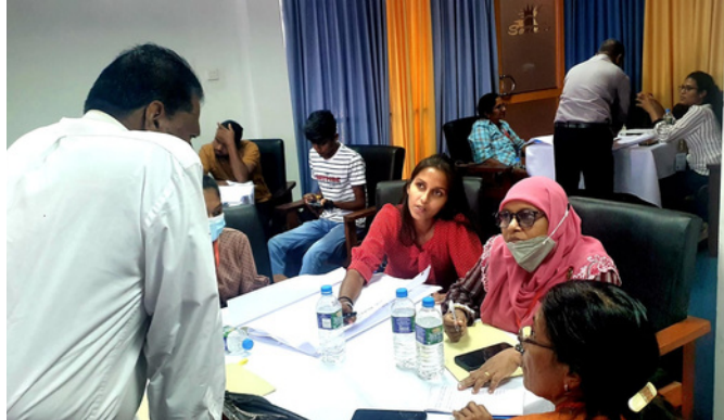
The panel headed by government officials responding to civil society and media enquiries