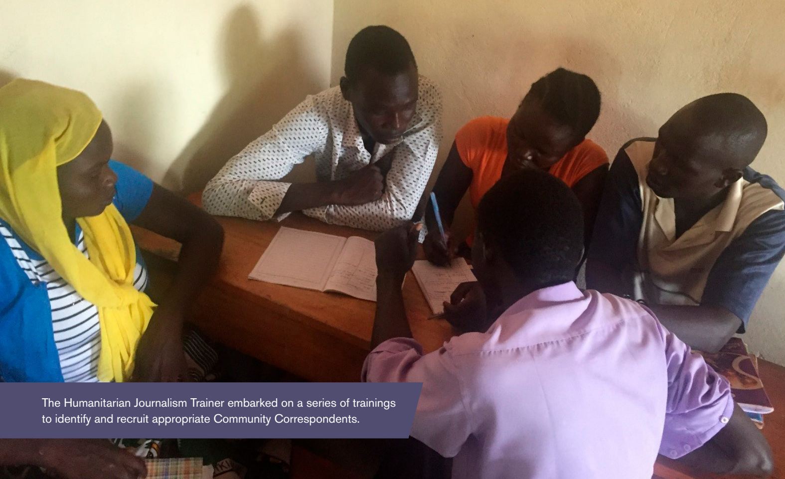
The Humanitarian Journalism Trainer embarked on a series of trainings to identify and recruit appropriate Community Correspondents.

responsibility of the HPM to ensure that the station staff understand and respect the dual roles of the station and do not record sensitive humanitarian information that is not intended for broadcast.