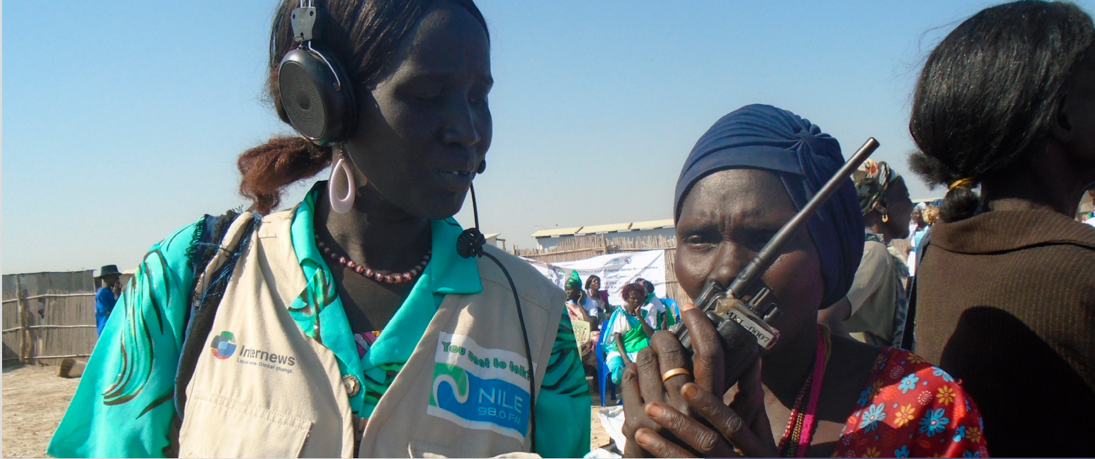
A Nile FM correspondent gathers community perspectives at an event in the PoC.