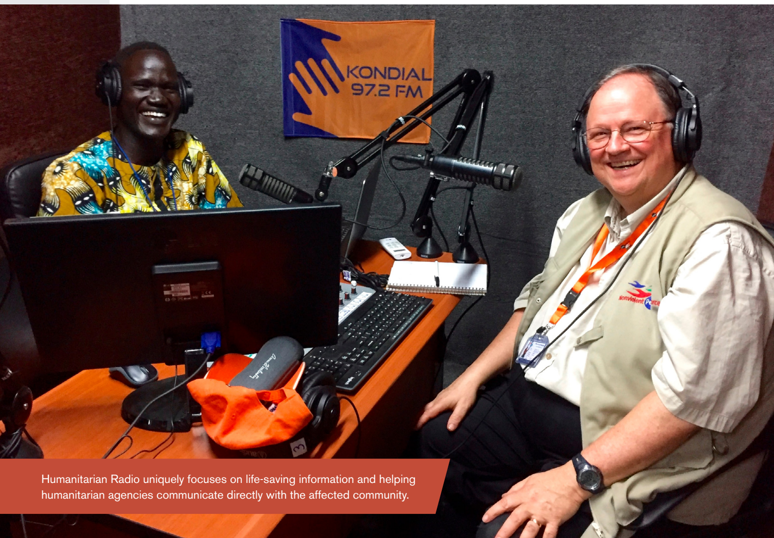
Humanitarian Radio uniquely focuses on life-saving information and helping humanitarian agencies communicate directly with the affected community.

The editorial principles of a Humanitarian Radio station also stand in contrast to a traditional broadcaster. While both styles of broadcasters agree on the fundamental editorial principles of fairness, accuracy, independence, and impartiality, Humanitarian Radio stations aim to provide “news you can use,” or more simply put, actionable information that directly benefits the population. While a traditional broadcaster may inform you that a flood has occurred, a Humanitarian Radio station will tell you how to stay safe from floodwaters, connect with family members in that area, find shelter and register for assistance.