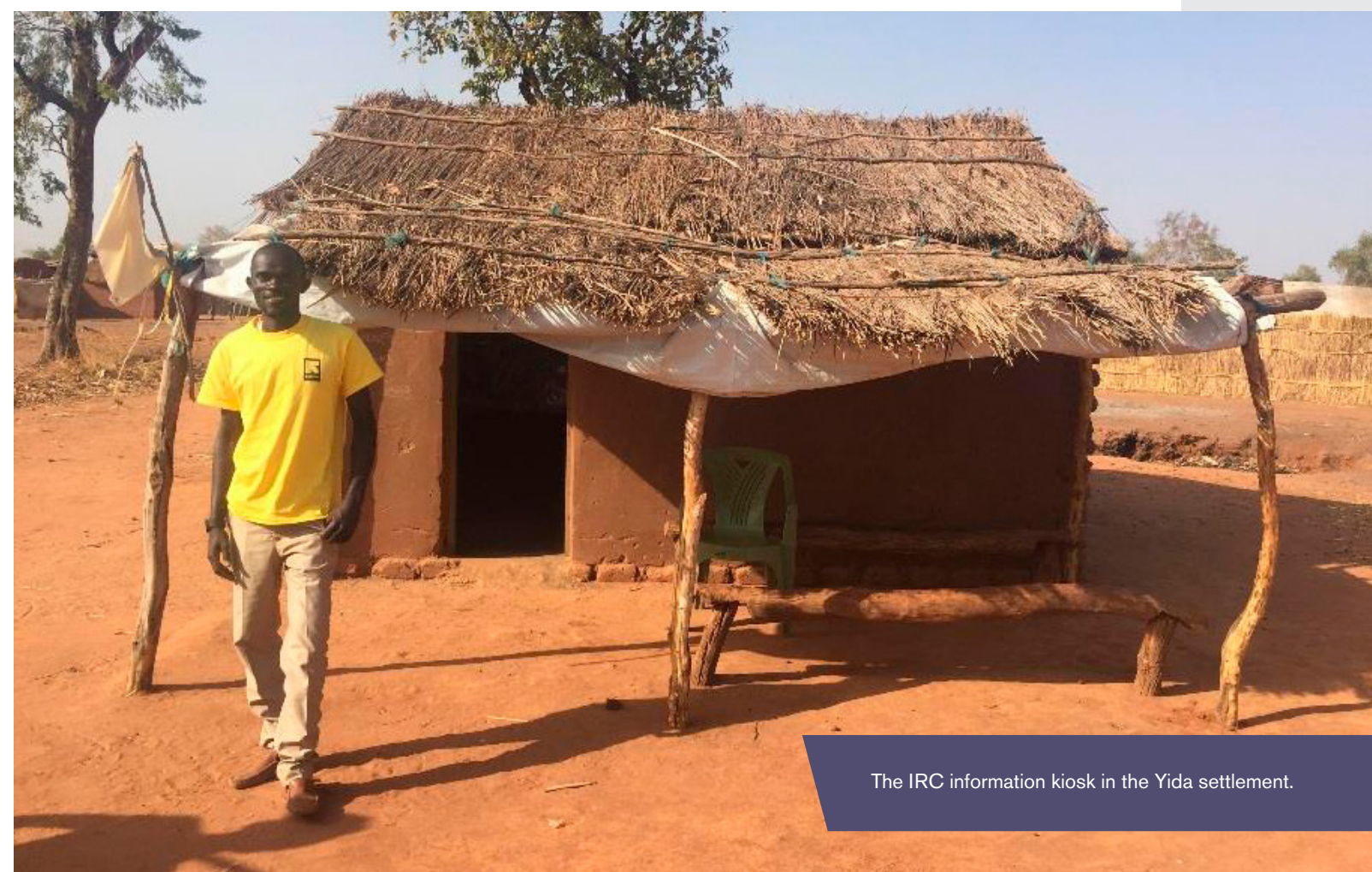
The IRC information kiosk in the Yida settlement.

Residents of Ajuong Thok were even more isolated, as the camp is extremely remote. Several people commented that they had radio sets, but threw them away or didn't use them because they could not hear anything when they turned them on (and therefore assumed the radios were broken). This lack of communication and media platforms for refugee and host communities increased their vulnerability; it also limited channels to promote humanitarian accountability.