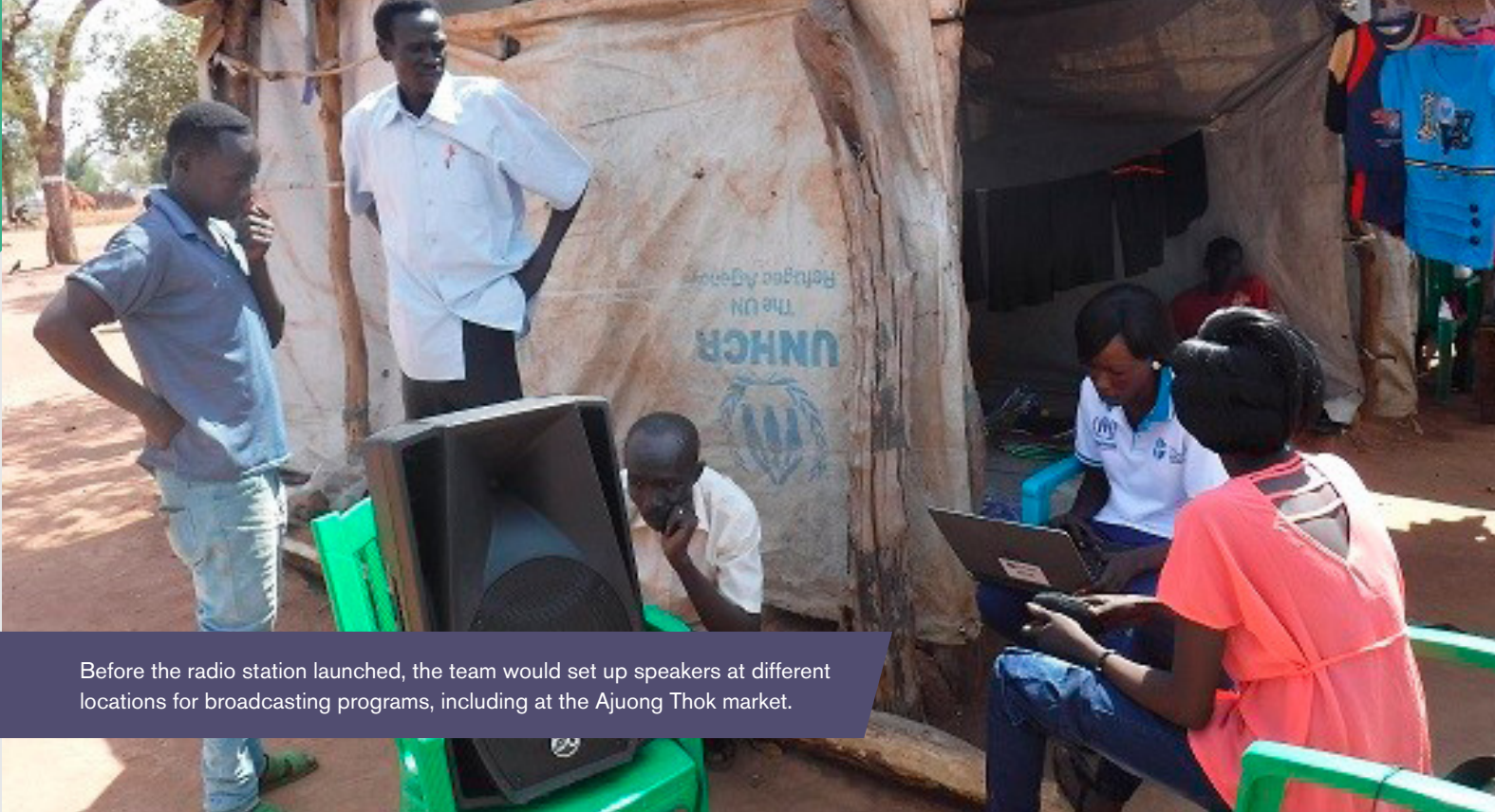
Before the radio station launched, the team would set up speakers at different locations for broadcasting programs, including at the Ajuong Thok market.