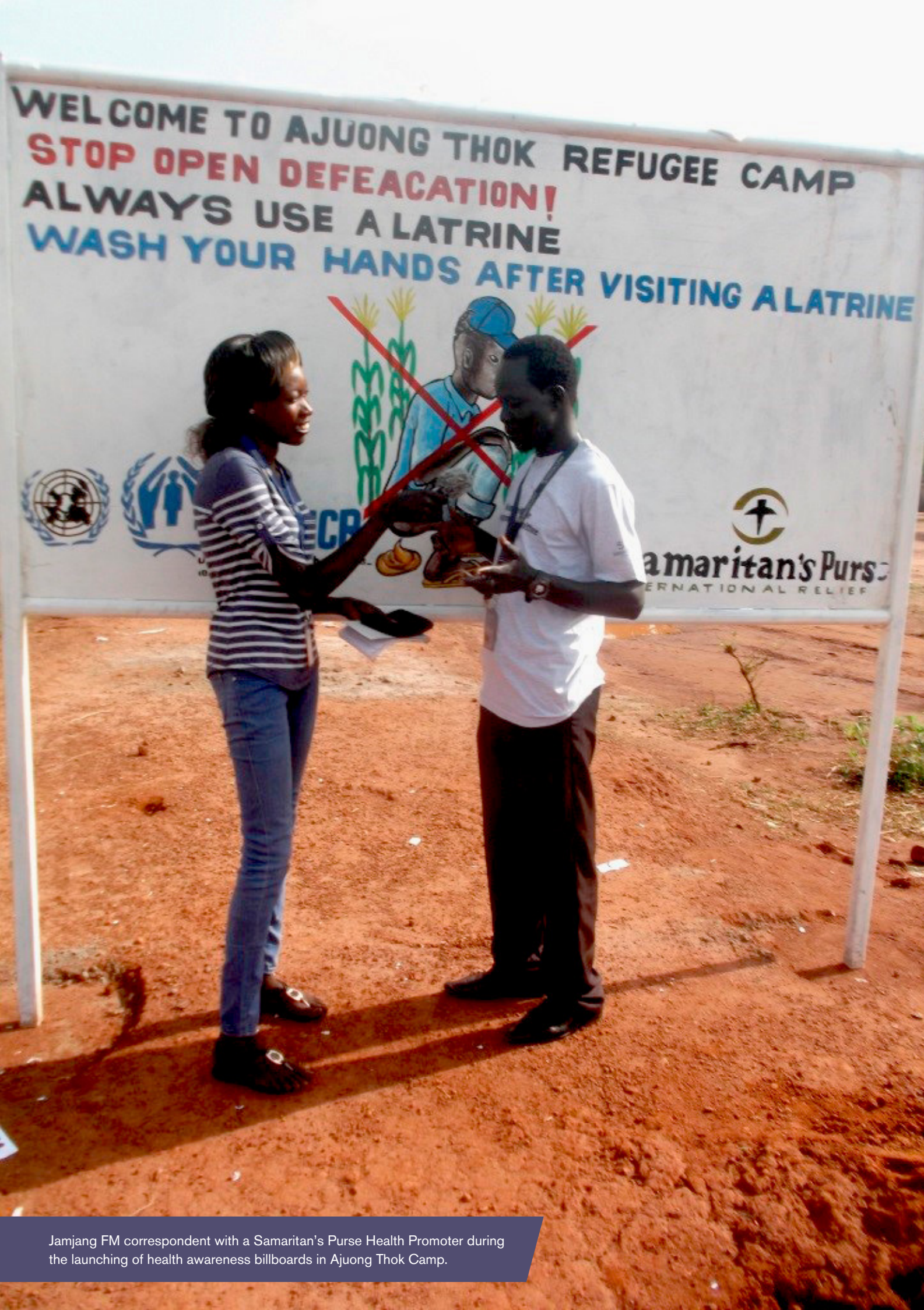
Jamjang FM correspondent with a Samaritan's Purse Health Promoter during the launching of health awareness billboards in Ajuong Thok Camp.