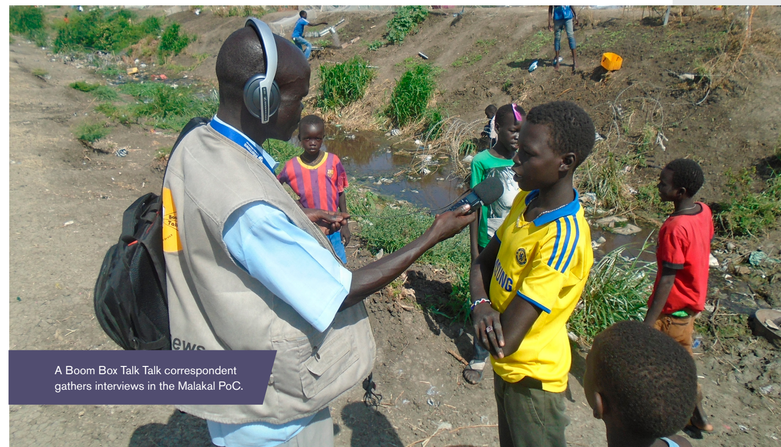
A Boom Box Talk Talk correspondent gathers interviews in the Malakal PoC.