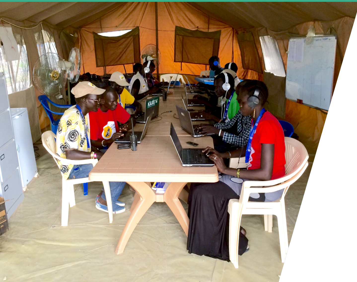
The HIS team in Bentiu took the successful Boda Boda Talk Talk project in the PoC and transformed it into a full-fledged Humanitarian Radio station, Kondial FM.