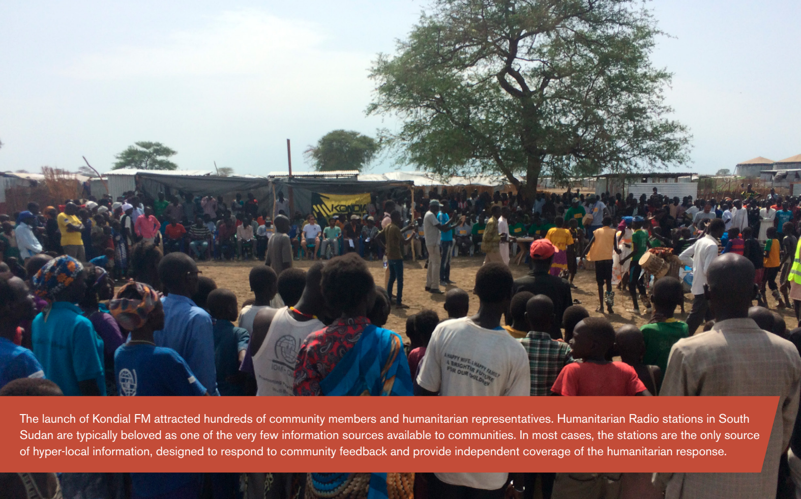
The launch of Kondial FM attracted hundreds of community members and humanitarian representatives. Humanitarian Radio stations in South Sudan are typically beloved as one of the very few information sources available to communities. In most cases, the stations are the only source of hyper-local information, designed to respond to community feedback and provide independent coverage of the humanitarian response.