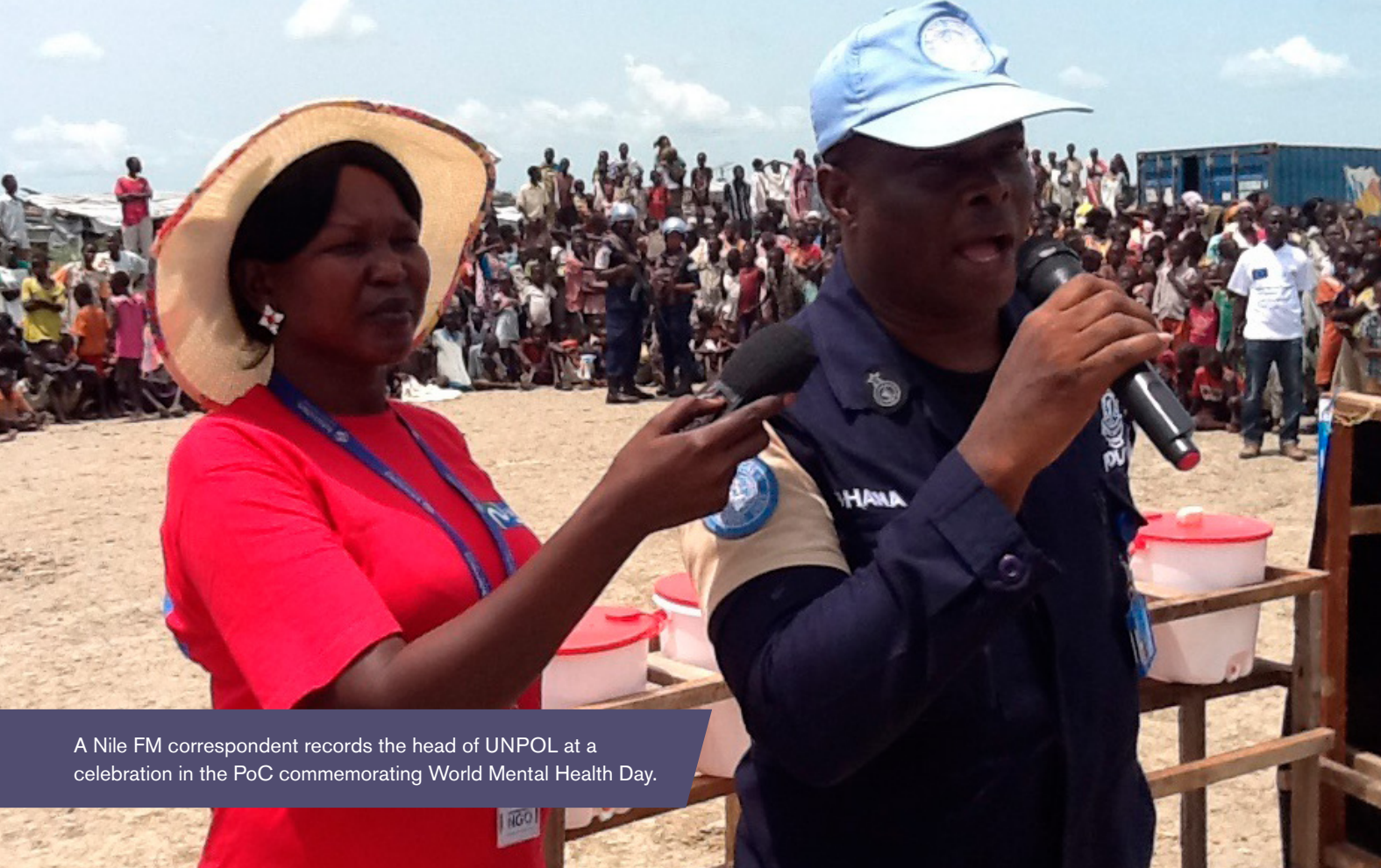
A Nile FM correspondent records the head of UNPOL at a celebration in the PoC commemorating World Mental Health Day.

In May 2015 the Nile FM team provided advice and inputs to partners like IOM, MSF Spain, and Solidarity to support their effort in preventing an outbreak of cholera in the PoC. Nile FM played a leading role in designing a four stage anti-cholera campaign that involved all WASH actors operating in the PoC and beyond. The campaign involved the design of a variety of PSAs played every two hours; interviews with experts on how to prevent cholera; a twice a week 30-minute radio show on cholera and how communities can work with partners to prevent its outbreak; Q&A sessions with the community; and dramas. Particular attention was given to target communities in Wau Shilluk, where agencies were unable to physically reach the area due to the security situation. Nile FM also reported regular updates on cholera on the 6.00pm live news bulletin.