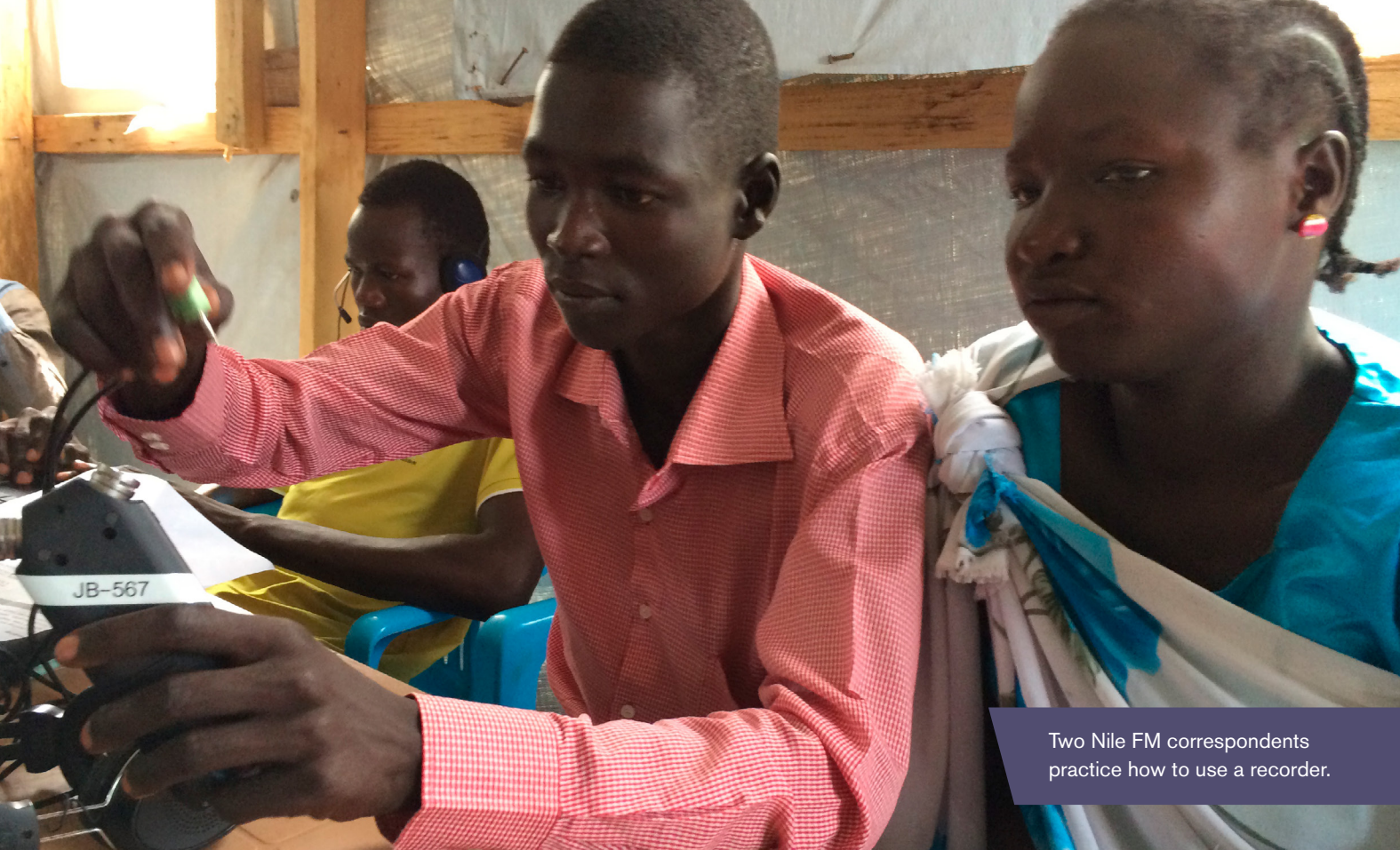
Two Nile FM correspondents practice how to use a recorder.

Through their active participation in the project, the audience is provided with relevant, accurate, timely information, enabling them to make choices and decisions about their own lives. Nile FM updates the affected community on services and aid provided by various humanitarian agencies and provides a platform for people to share their experiences and feedback relating to camp conditions and humanitarian services. The program also gives space to the community to share their personal messages, including messages of peace and encouragement, and ask questions directly to representatives from humanitarian agencies working on the site. Nile FM acts as a useful accountability mechanism for the NGOs and community who use the service to gather feedback and gauge the views of listeners.