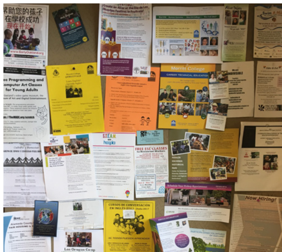
The bulletin board at the César Chávez branch library is a space for information on local resources and events.

The César Chávez branch is one of several libraries that serve Oakland’s Latino immigrants, though its collection and programming perhaps caters to the Latino