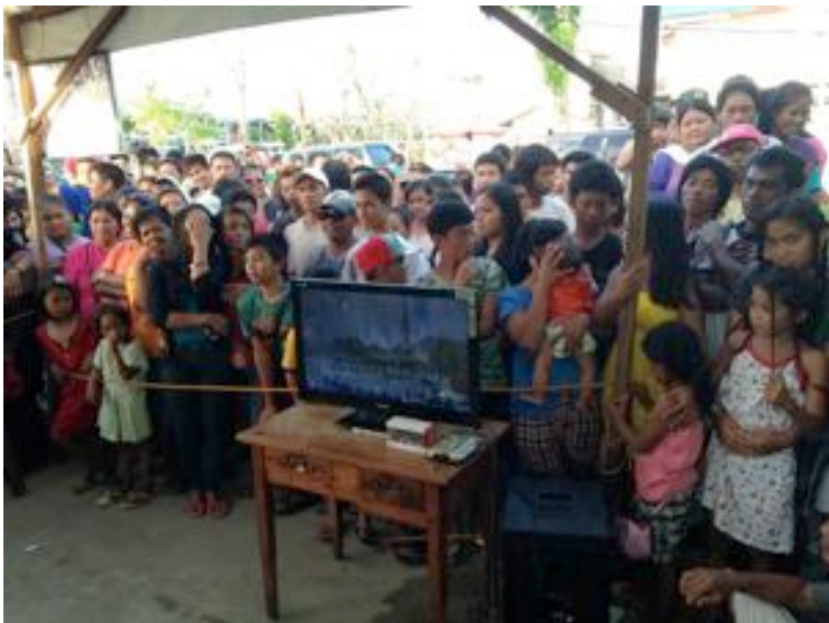
Figure 10: Live Karaoke Contest on Radyo Bakdaw

The karaoke-contest draws a large audience, who, when being interviewed, all indicate how the show makes them feel more “human”, by just being able to sing and have fun together.