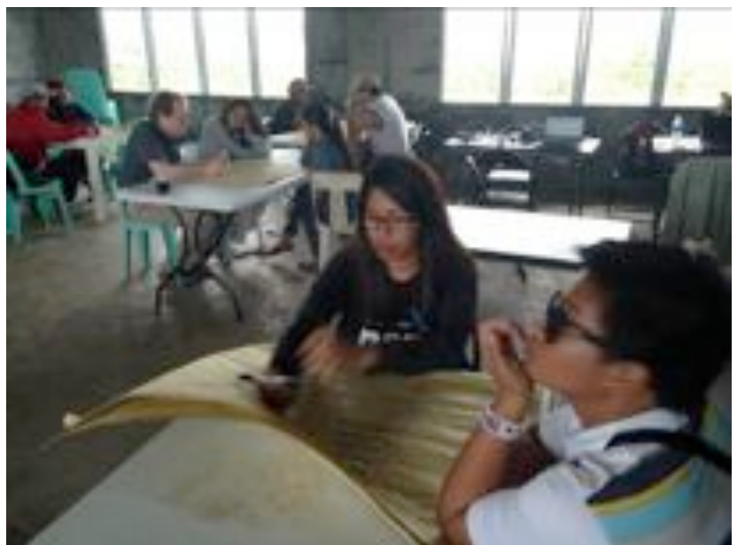
Figure 14: Training session with Bakdaw staff

In Guiuan, after going off air, Internews also gave a training session on humanitarian reporting and journalism ethics to the staff of Radyo Natin, some staff of the municipality and a group of students.