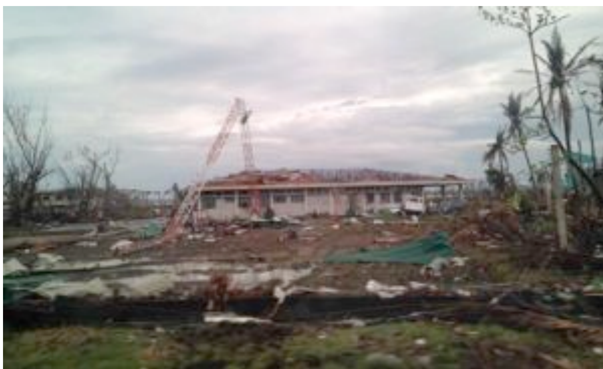
Figure 3: former radio station outside of Tacloban