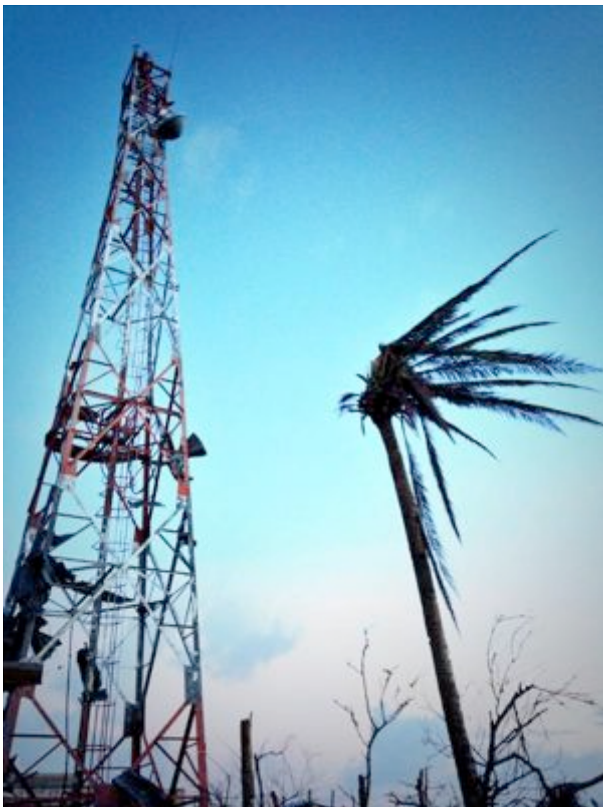
Figure 1: Telecom mast in Guiuan, Eastern Samar, later to be used to put up Radyo Bakdaw's antenna.