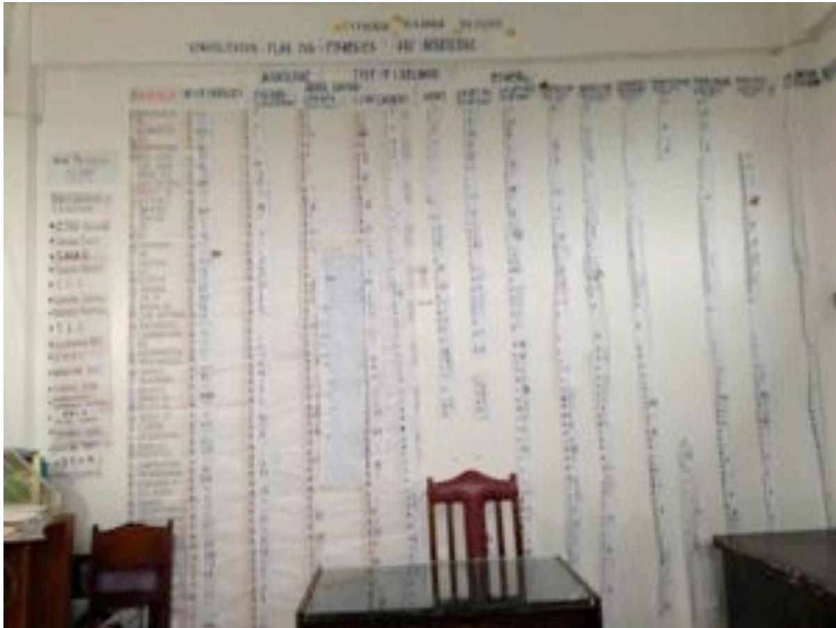
Figure 16: wall with the latest statistics in the town hall of Guiuan