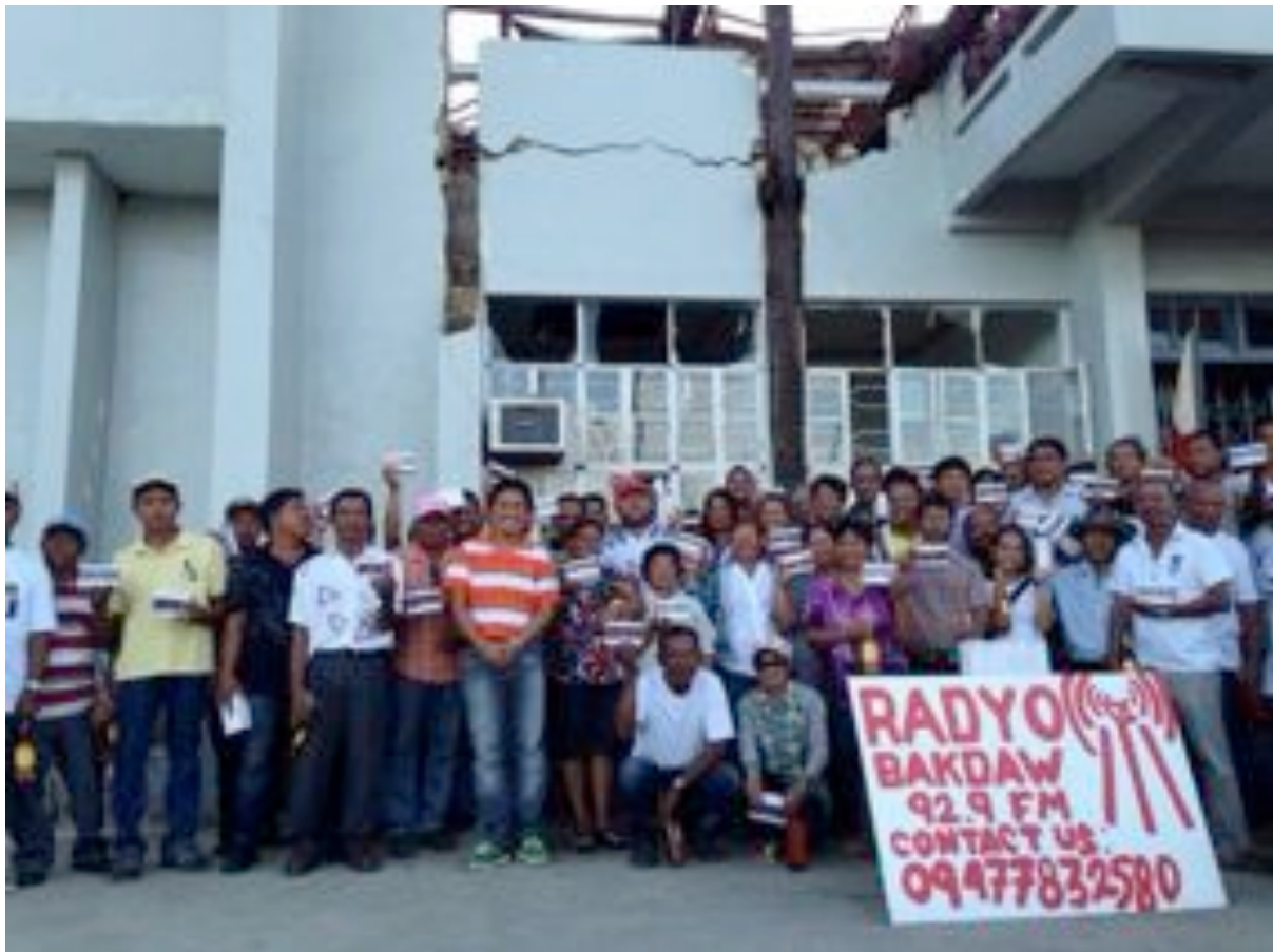
Figure 8: Distribution of solar radios to the barangay captains of Guiuan, Eastern Samar

For Guiuan, Internews was invited to the swearing in ceremony of the 60 Barangay captains of Guiuan. A formal handover was written into the programme and Internews was given the opportunity to speak to all barangay captains and other representatives of local government on the importance of communication in the humanitarian response.