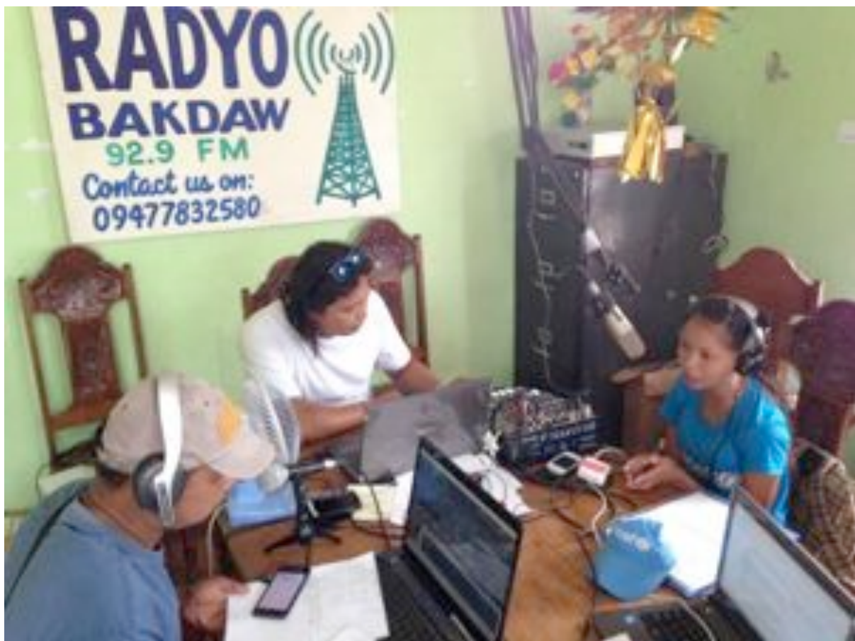
Figure 15: UNICEF guest on Radyo Bakdaw

The development of these shows has been driven and supervised by the Humanitarian Reporting Trainer who used the production-phase of two weeks to give a lot of extra trainings for our staff on a variety of topics (interviewing, drama-production, recording skills...).