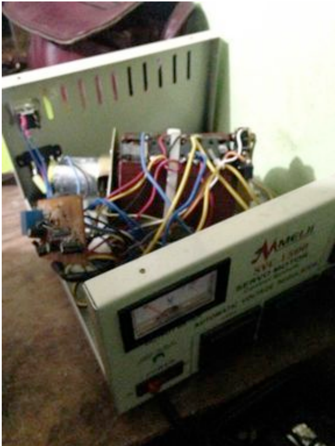
Figure 12: a broken Automatic Volume Regulator at the Radyo Bakdaw studio