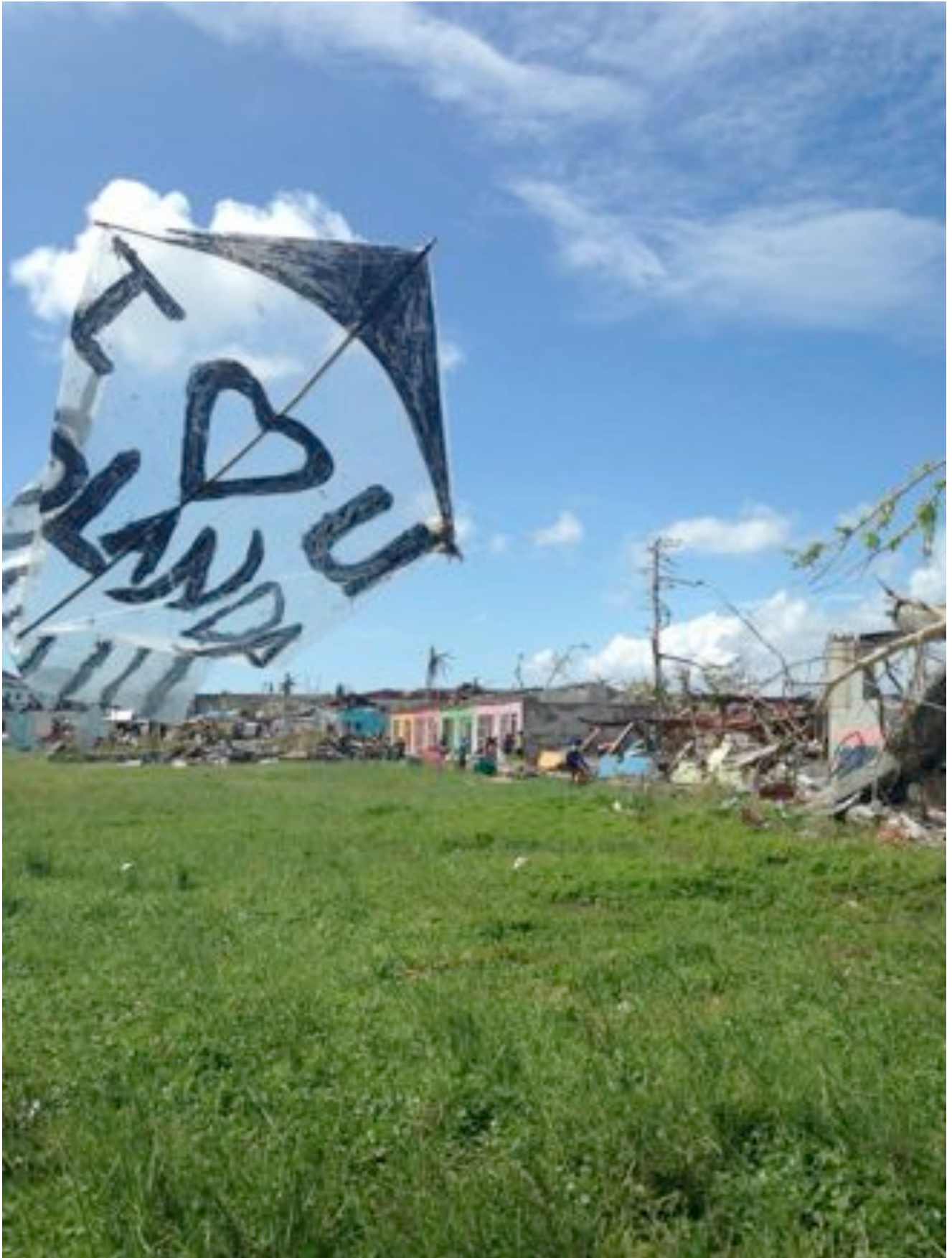
Figure 2 "I love Yolanda" kite, made by local youngsters in Guiuan, Eastern Samar