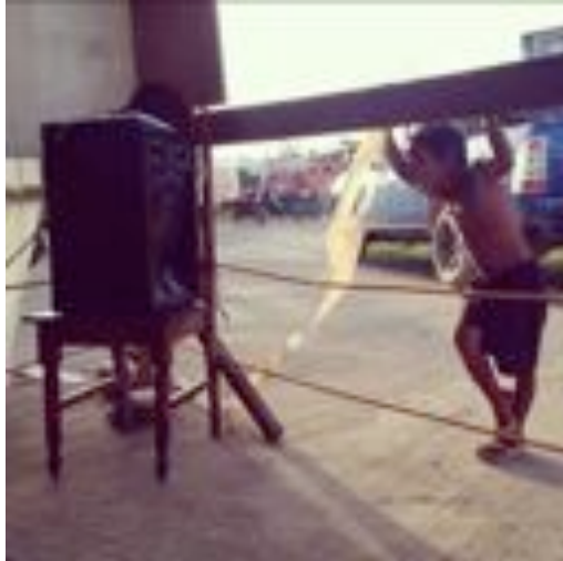
Figure 9: One very attentive listener

According to accounts from Telecom Sans Frontieres, FM signal is still available in Marabut, 86 kilometres down the road from Guiuan to Tacloban. Obviously the distance is shorter “as the crow flies”, but either way this is the longest distance which has been reported to us.