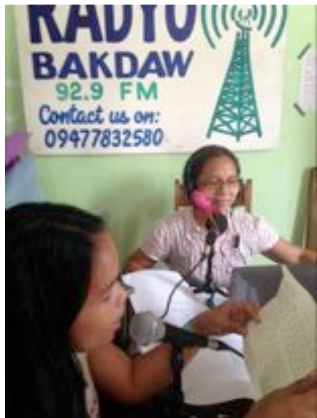
Figure 6: a letter from a listener on Valentine's Day

Every day, around 8 p.m. the studio phone receives text messages requesting not to stop broadcasting.