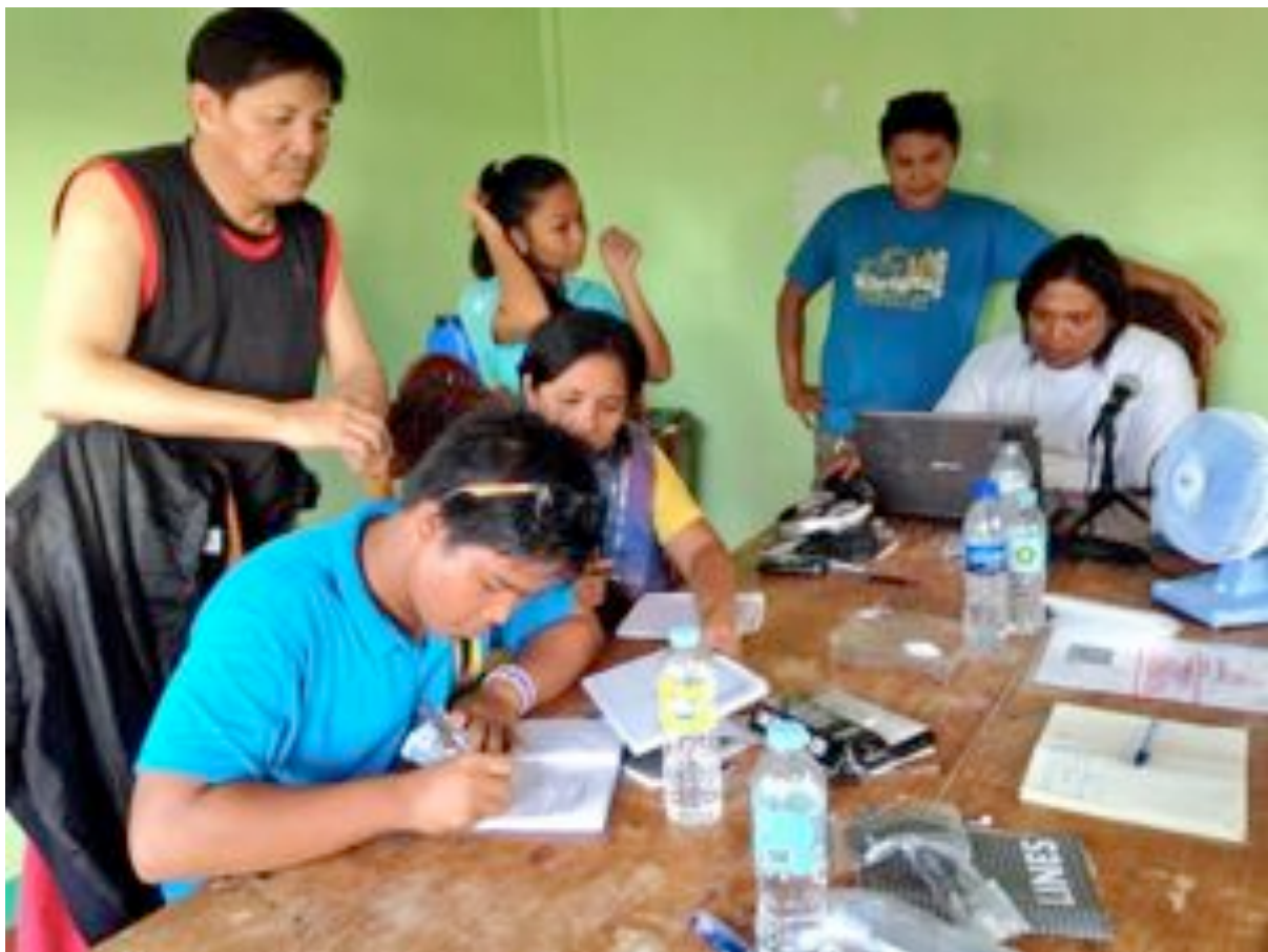
Figure 4: part of the start up team of Radyo Bakdaw

After consulting the humanitarian partners, including ILO, and a meeting with the owner of the previous radio station, staff will receive a salary of 600 PhP/pesos a day (about 8 GBP).