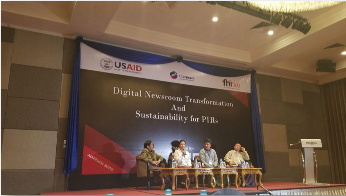
Digital Newsroom Transformation Media Conference, July 17, 2018