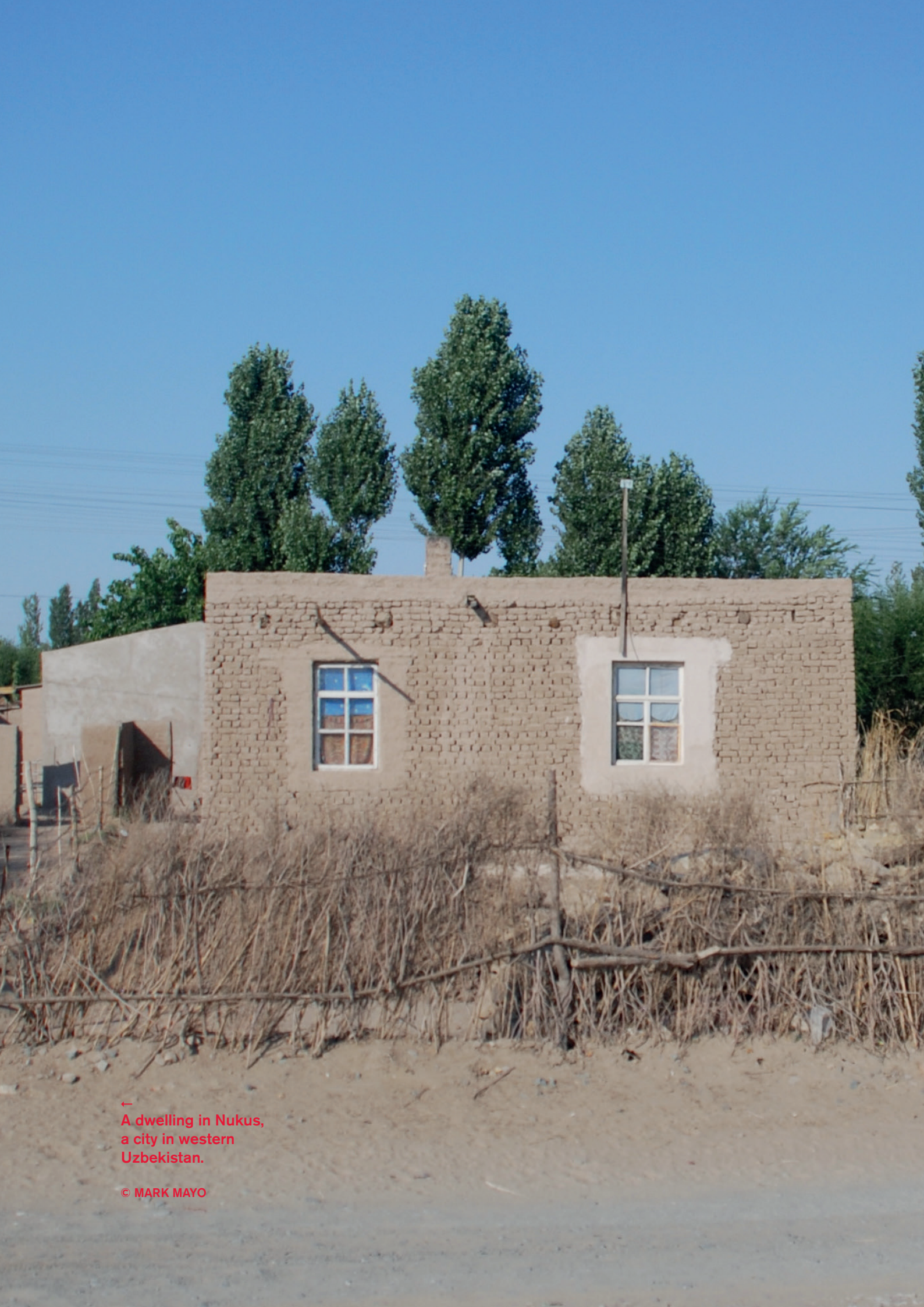
← A dwelling in Nukus, a city in western Uzbekistan.