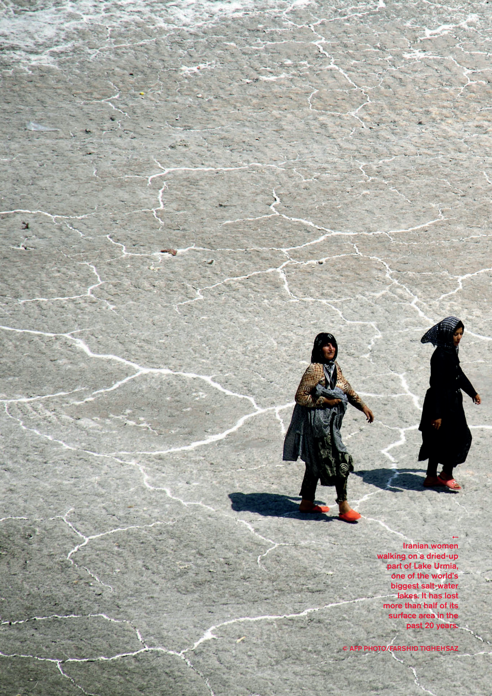
← Iranian women walking on a dried-up part of Lake Urmia, one of the world's biggest salt-water lakes. It has lost more than half of its surface area in the past 20 years.