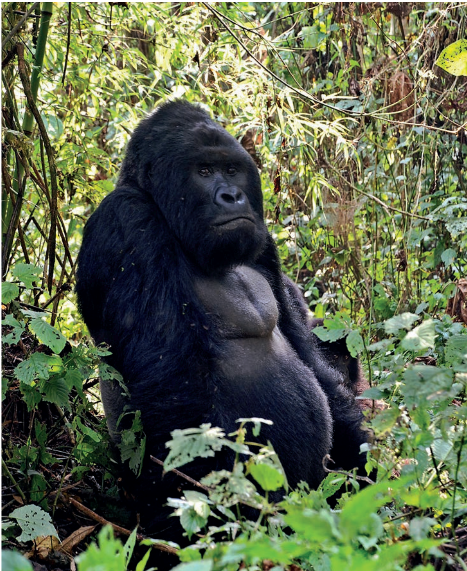
← Democratic Republic of Congo's 7,800-square-kilometre Virunga National Park is home to a quarter of the world's remaining Mountain Gorillas. It is now classified as an "endangered" UNESCO World Heritage Site.

"Our job is to report accurately and stand firm in the face of such pressure," Randerson says. RSF notes the increasing strength of environmental journalists' associations opposing governmental and corporate attempts to restrict freedom of information.