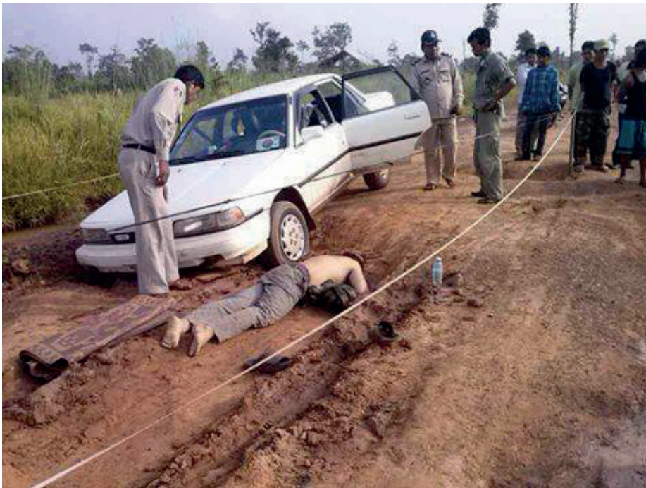
← Cambodian journalist Taing Try, 40, was killed in the southern province of Kratie on 12 October 2014.

Chut Wutty, an environmentalist who worked as a fixer, was killed on 26 April 2012 in the southwestern province of Koh Kong while accompanying two Cambodia Daily journalists who were doing a story on wine production in a protected forest region. On their way back, they were stopped at a checkpoint where military police asked them for the memory cards of their cameras. Chut Wutty refused and, when he started the car with the aim of leaving, the police shot him.